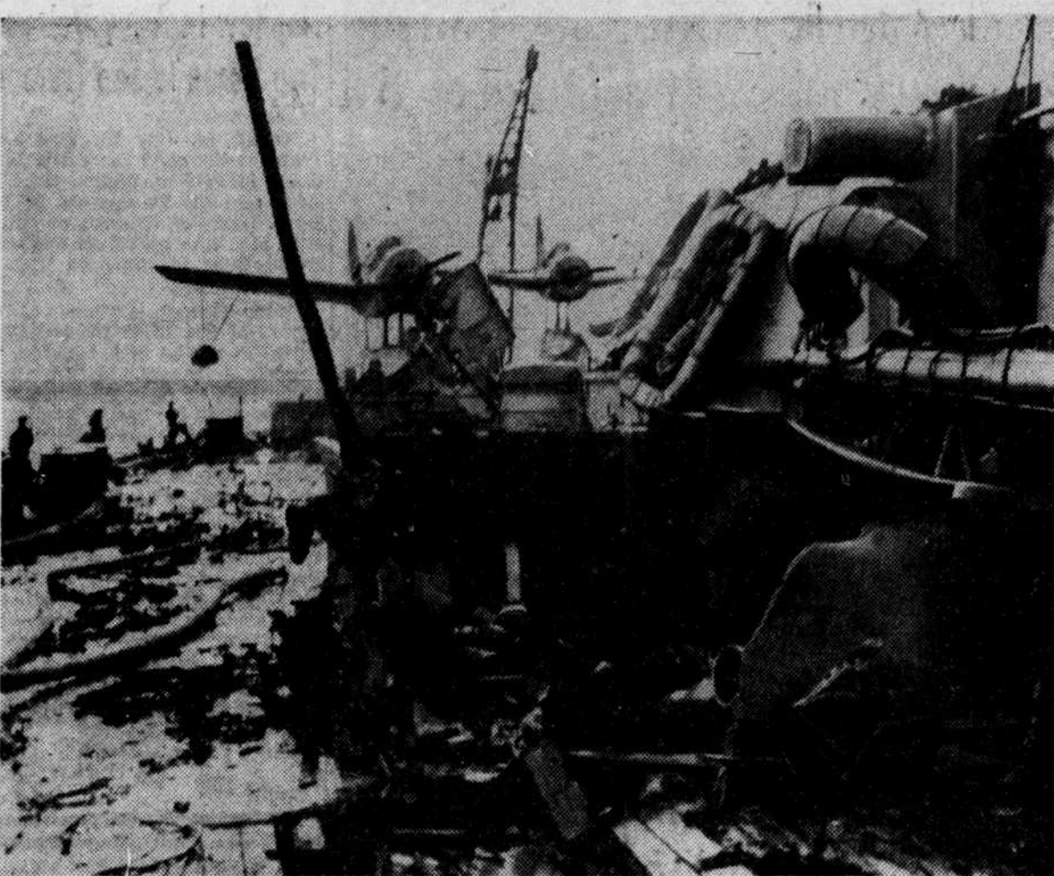
PEARL HARBOR 'VICTIM' SLUGS JAPS AGAIN —Shown is the forward deck of the battleship Nevada after she was struck by a Jap suicide plane off Okinawa on March 27. Despite 60 casualties and heavy damage, the ship was out of the firing line for only four hours, and still carries on against the enemy. A week after this blow she knocked out a Jap shore battery.