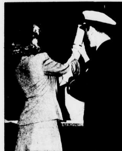
REHEARSAL. Sponsor picks up some pointers from the Navy

There used to be a good deal of fuss and feathers about christenings. Shipyards vied with one another to line up glamorous movie stars and society leaders as sponsors. But nowadays the lucky lady is apt to be Mrs. John Smith, wife of a welder. One New York yard, the Greenport Basin Company, has workers' wives signed up for nearly 100 future launchings.