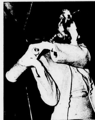
BATTING PRACTICE—one last swing with the dummy bottle

About the only hazard connected with a launching is the champagne shower. Navy officers who stand with the sponsor on the christening platform are generally expert duckers. (Watch 'em jump the next time you see a launching in the newsreels.) But the lady just has to stand there and take her medicine.