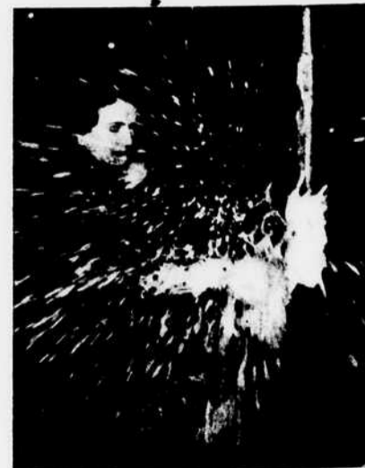
HOME RUN! Ship's off to sea — lady's off to the cleaners