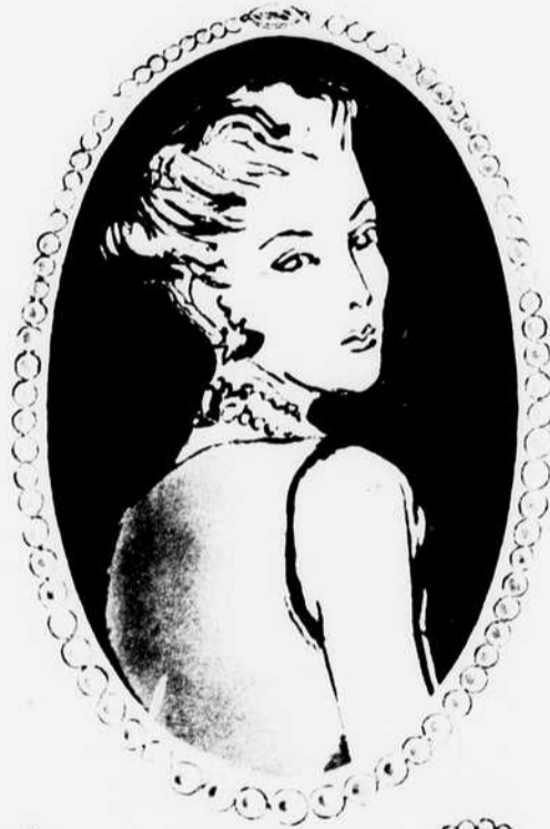
Cultured pearl necklace, an exquisite strand of perfectly matched pearls, 275. tax included

921 F Street . . . address of jewelry distinction since 1885