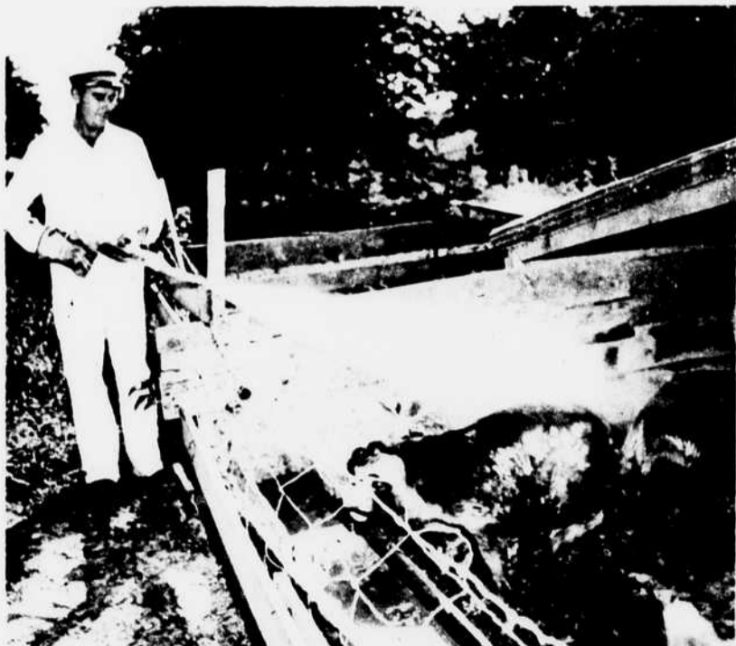
DDT is sprayed in pig pens to kill flies where they breed.

921 F Street . . . address of jewelry distinction since 1885