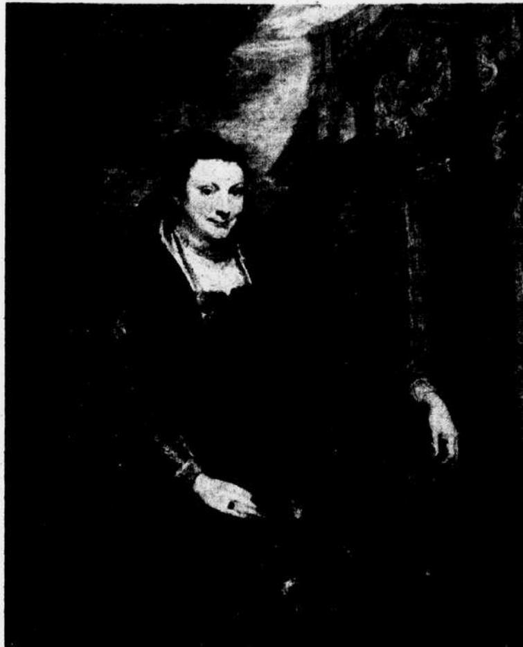
Picture of the Week at the National Gallery of Art is "Isabella Brant," by Rubens (Mellon collection). It will be the subject of a brief talk tomorrow through Saturday at 12:30 and 2:30 p.m., and next Sunday at 2:30 and 6:30 p.m.