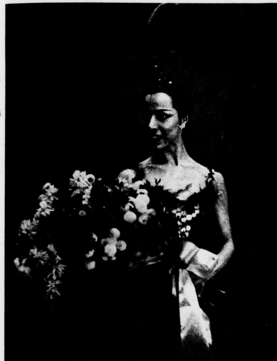
HOME-GROWN ballerina: Maria Tallchief specializes in the impossible

For Maria, dark-haired and delicately bronzed, was born on an Osage reservation in Oklahoma, daughter of an Indian father and a Scottish mother,