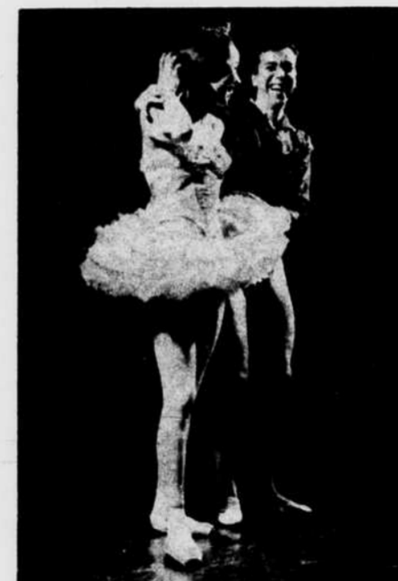
4 WHICH breaks up the number