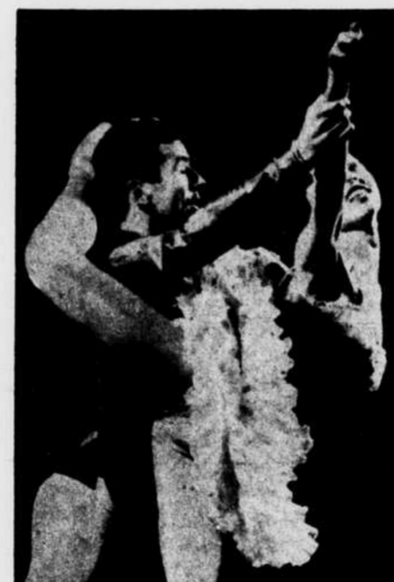
3 SURPRISING him with a kick...