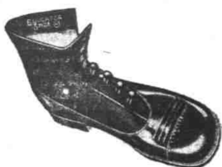
Patent Colt Skin

Main Store 1116-22 7th Street Branch Store 813 Pa. Avenue