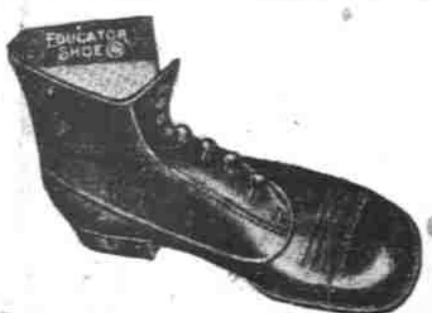
Gun Metal Calfskin