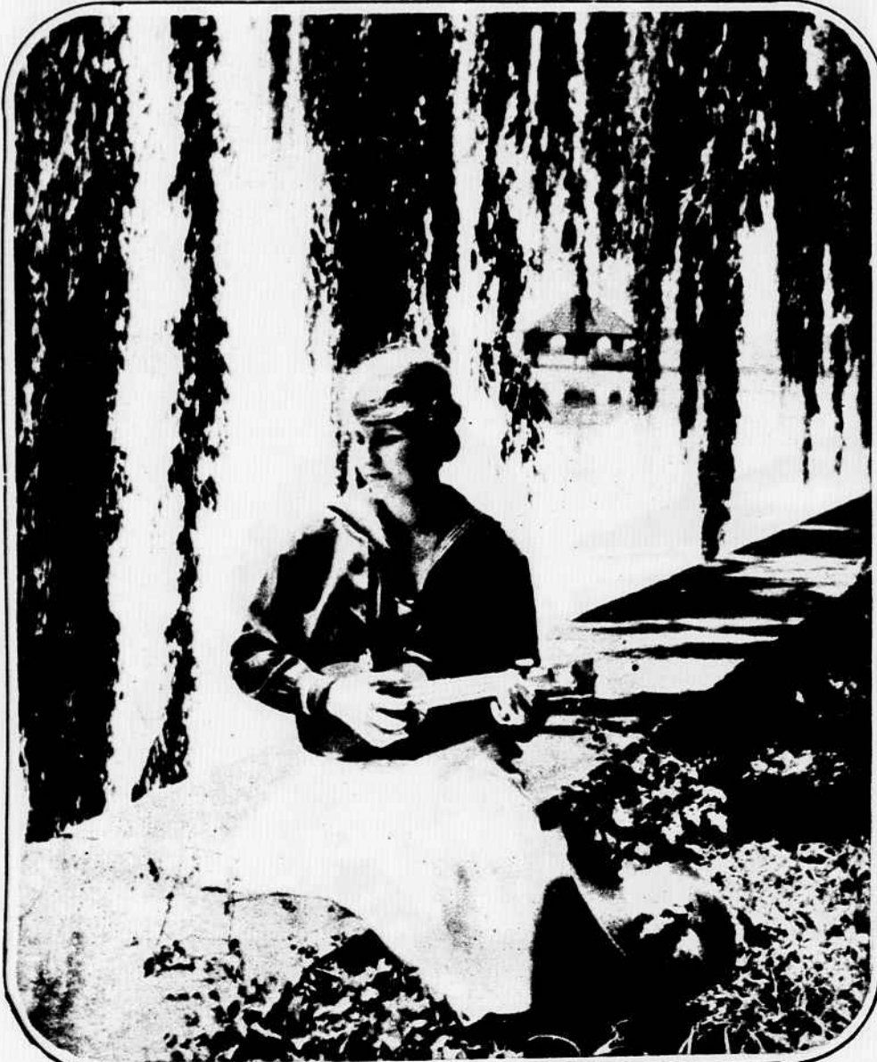
"Dreaming." Photograph by Miss Helen Dayton, 1725 17th street north-west, winner of The Star's weekly prize of $10 for the best amateur photograph.