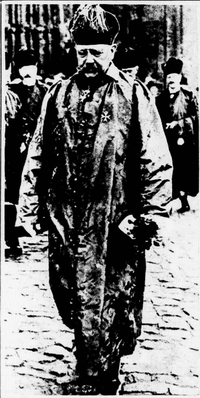
Field Marshal von Hindenburg as a deacon of a church. He was photographed when leaving the celebration of the festival of the Brandenburg Cathedral. He is garbed in a silk robe and carries a bouquet.