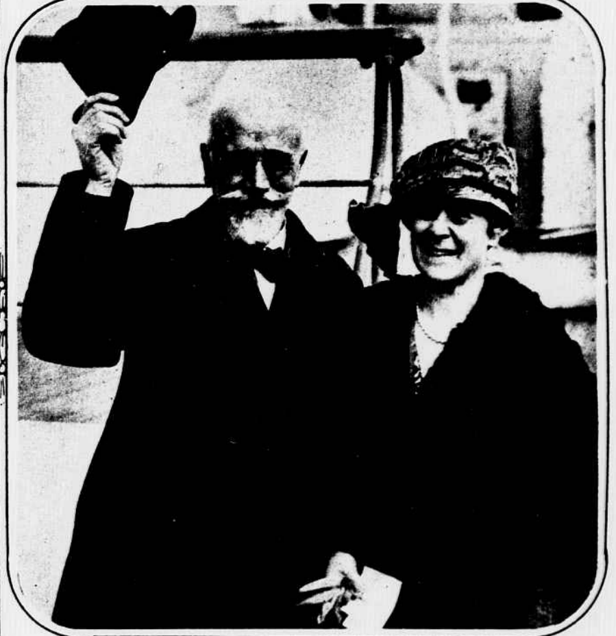
Eleutherios Venizelos, former Greek premier, and his bride arrive in America on their honeymoon trip. They were given a rousing reception at the New York docks by practically all of the city's Greek population.