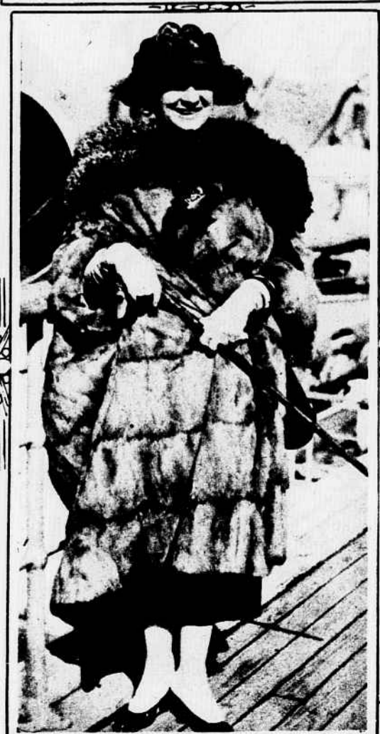
Mary Garden, impresario of the Chicago Opera Company, returns from Europe to take up the season's musical work. She engaged several European singers while abroad.