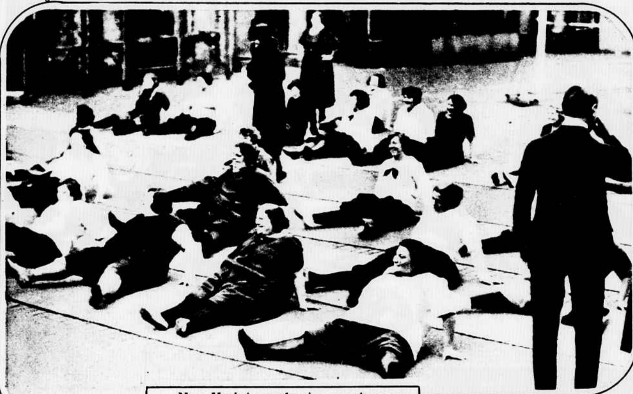
New York is conducting a unique contest in "reduction" between a squad of men and a squad of women. The women, part of them in the photograph, are banting under the direction of Dr. Royal S. Cope land, health commissioner of the city. A woman beauty specialist is directing the men in their efforts.