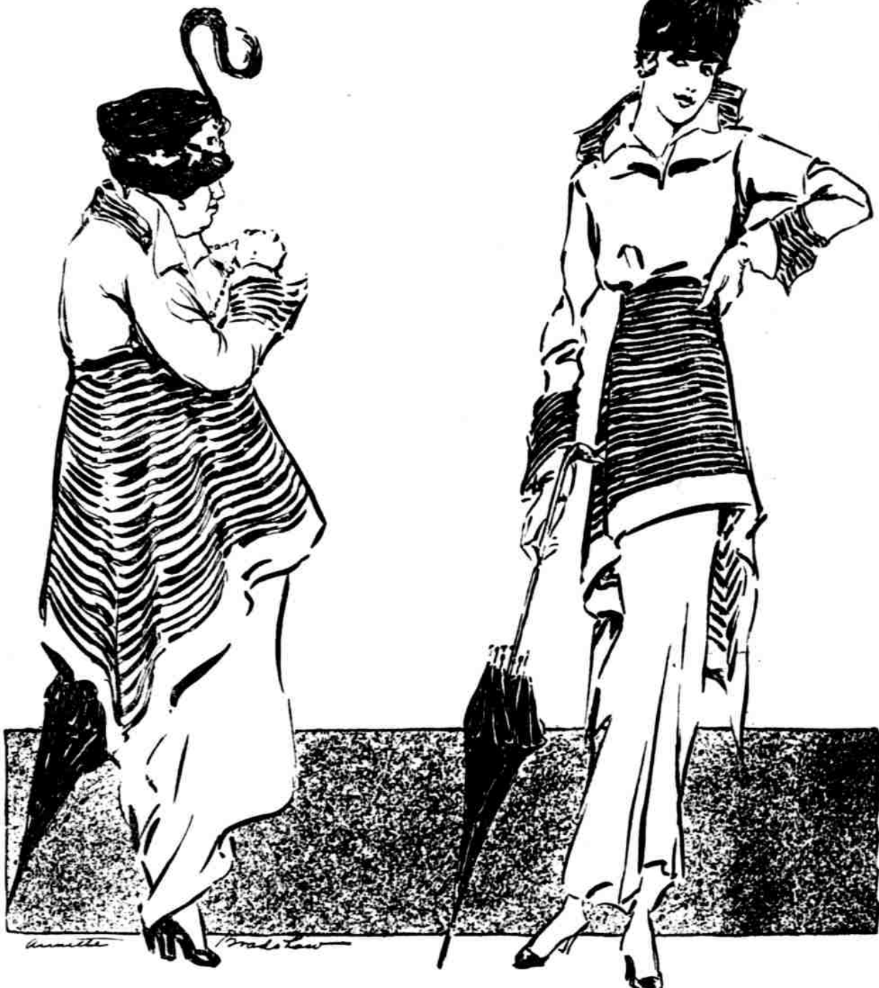
THE THIN ONE "Poor thing! Isn't it a pity some one doesn't tell her how unbecoming this style is for her? Thank goodness, I'm not built on those lines!"