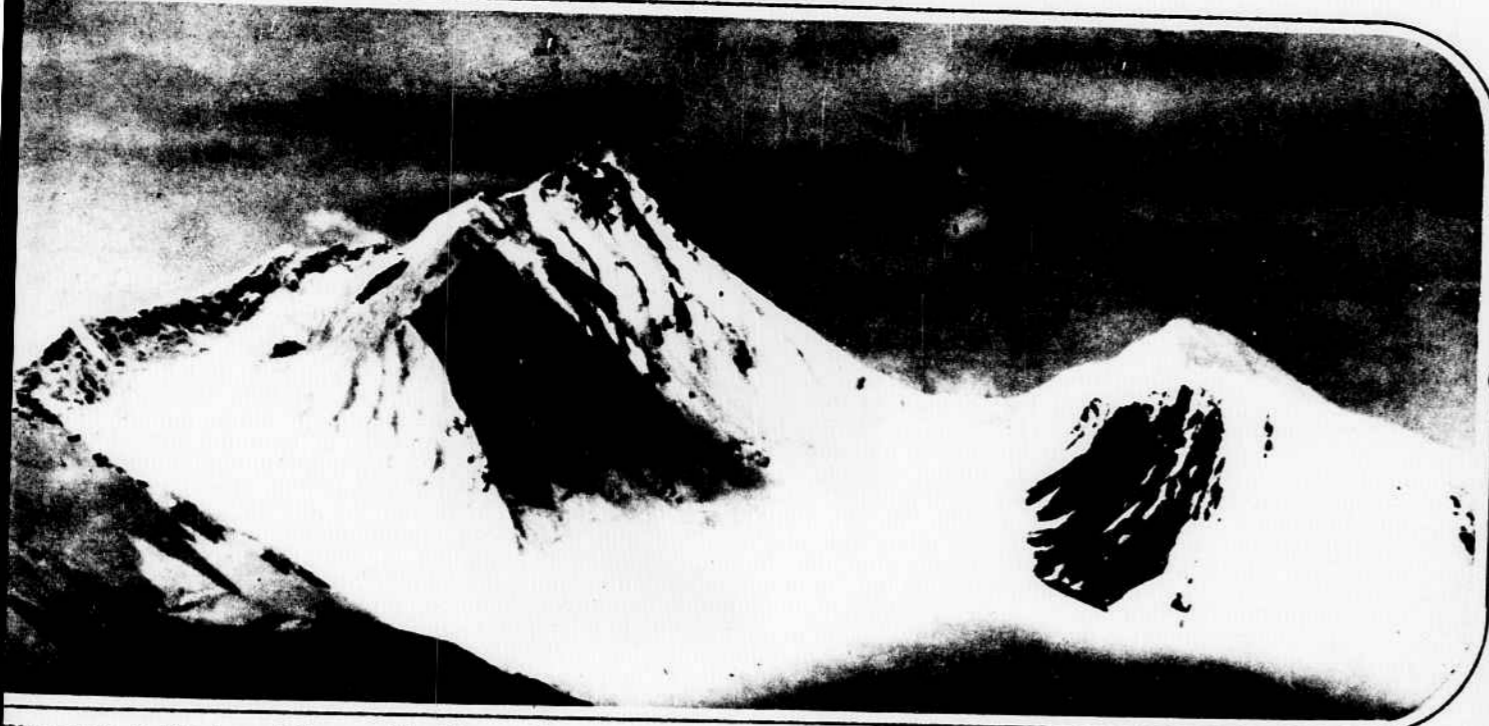
The route to the top of the world. Mount Everest, the loftiest peak in the world, photographed from an elevation of 22,500 feet. One of the pictures sent back by the Royal Geographical Society's expedition.