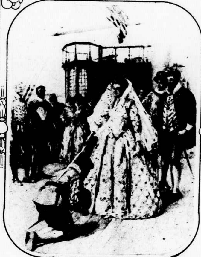
Queen Mary's Christmas card. It shows Queen Elizabeth, on board the Royal Hind, knight-ing Sir Francis Drake, the first Englishman to sail around the globe.