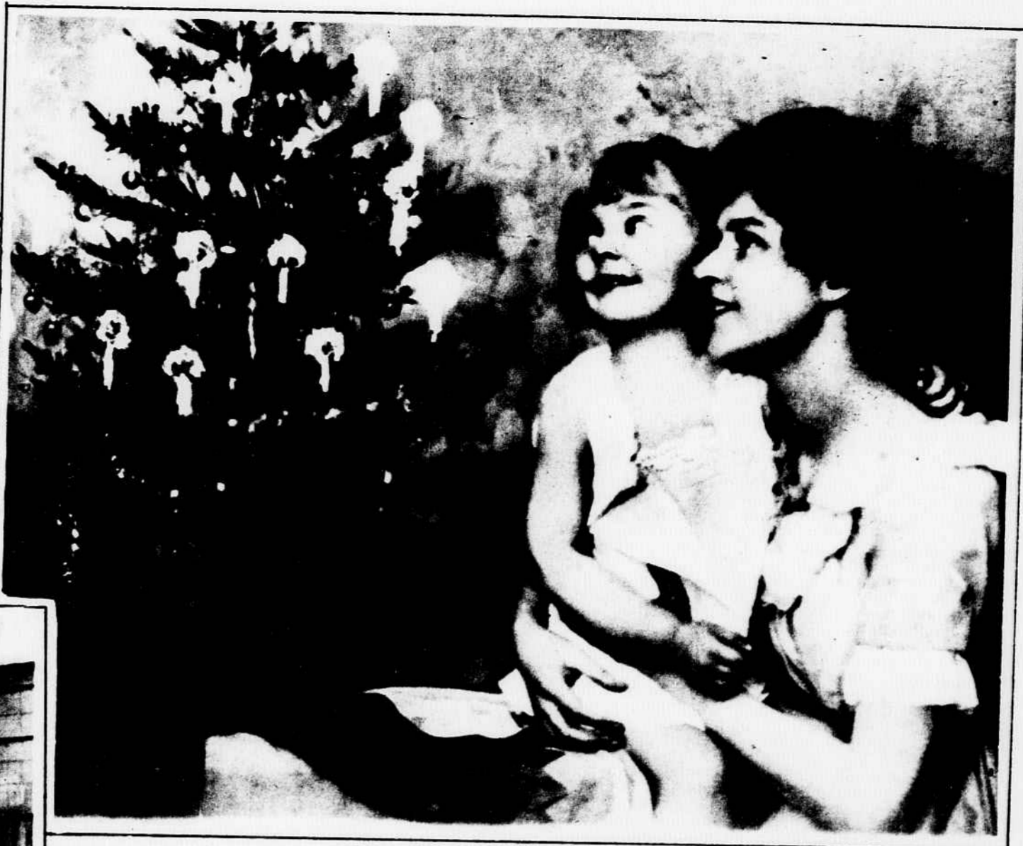
Christmas morning and that glory of the Christmas season—the tree.