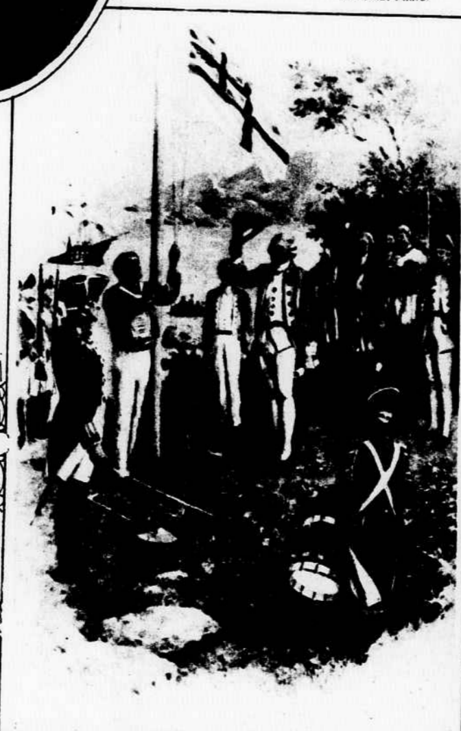
Christmas card of the Prince of Wales. It represents Capt. James Cook hoisting the British flag on "the great southland" of Australia in 1770, adding that continent to the British empire.