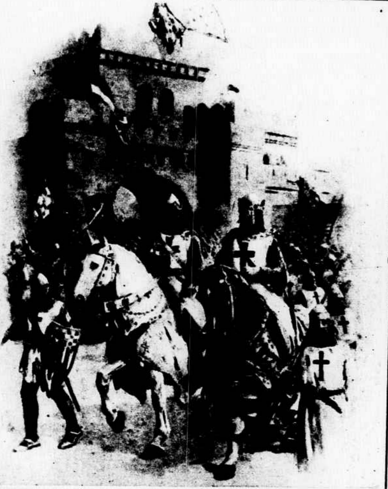
Christmas card sent out by King George of England. It represents King Richard of England and Phillip of France setting up their standards at Acre, which town had surrendered in 1191.