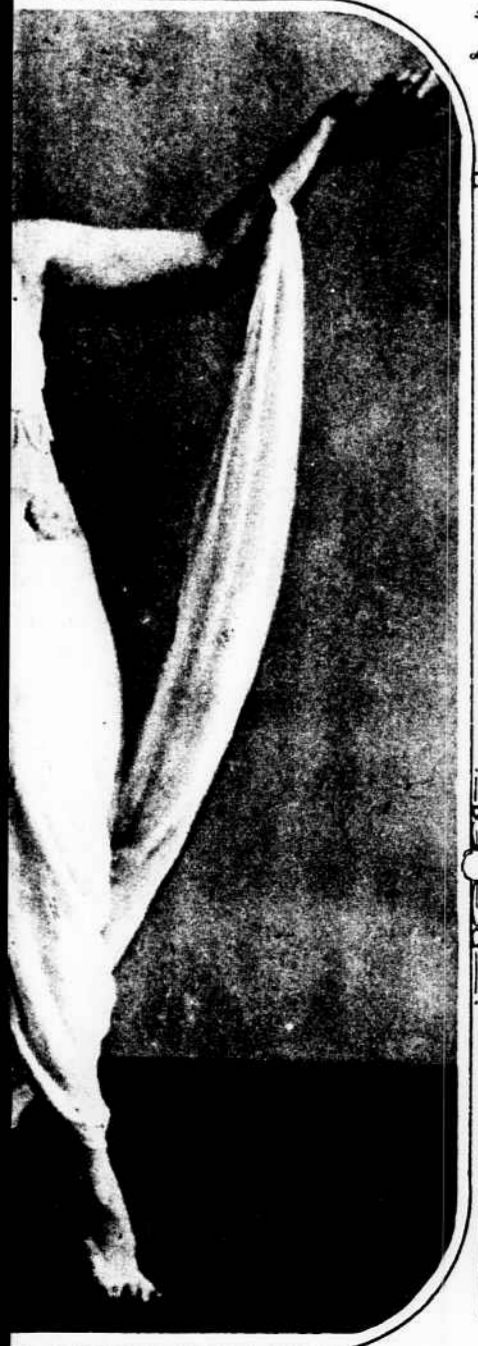
Terpsichore has no more gifted pupil, an American dancer and pupil