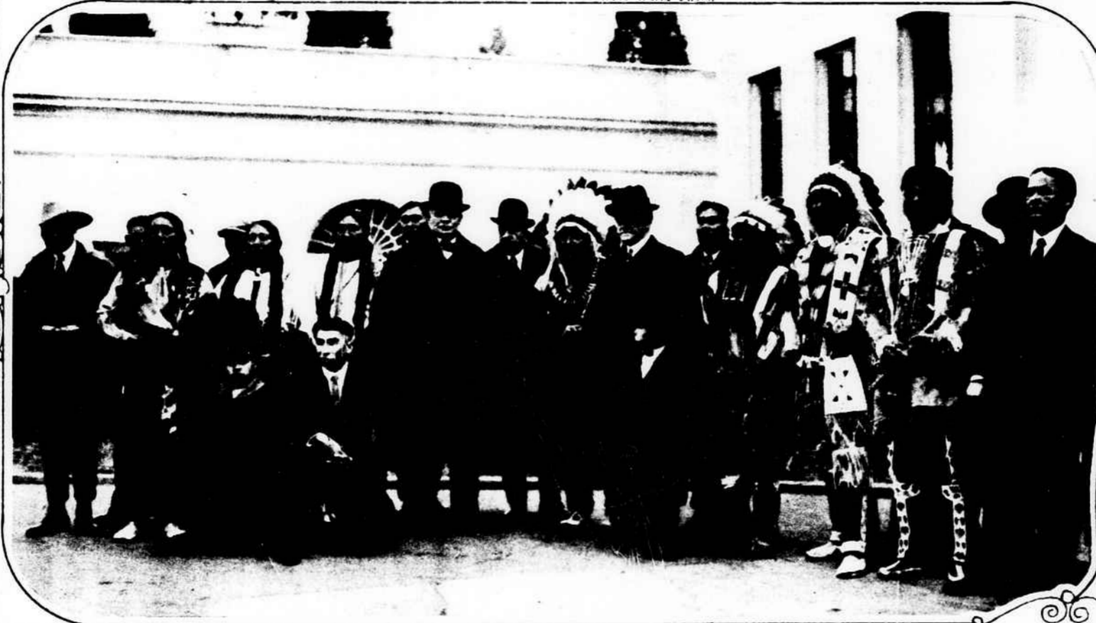
Group of Oklahoma Indians in Washington on a tribal business call. They were escorted to the White House by Gen. Hugh T. Scott, former chief of staff of the United States Army.