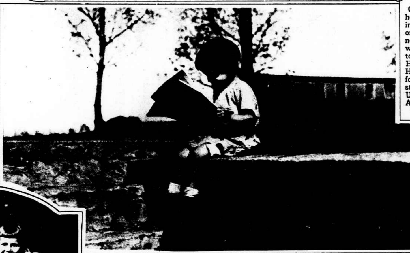
"A Sunday Morning With Mutt and Jeff." Photograph by Edwin L. Wisard, 1440 Rhode Island avenue northwest, winner of The Star's weekly prize of $10 for the best amateur photograph.