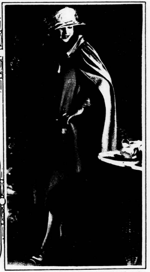
One of the newest and smartest of early spring one-piece dresses with cape. It is of a fine white and black check, with the cape and bindings of green.