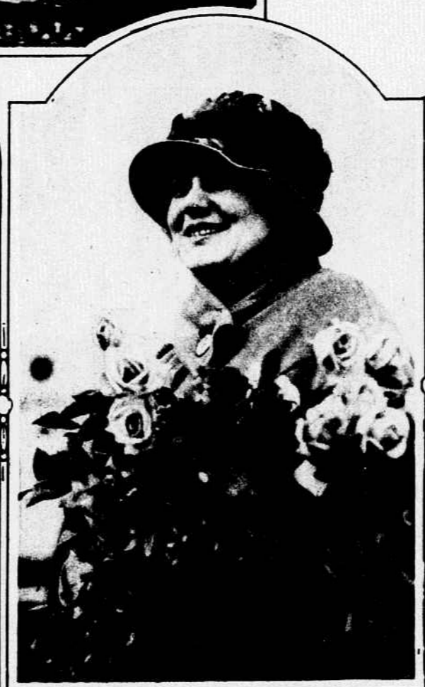
Mme. Maria Jeritza, Metropolitan songbird, returns to her home in Austria after a successful season in America. She will return in the autumn.