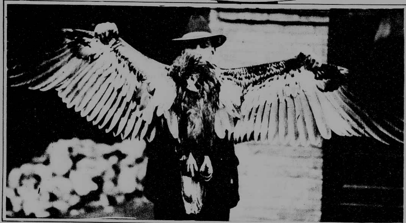
ONE OF UNCLE SAM'S NATIONAL BIRDS , a year-old bald-headed eagle with a seven-foot wing spread, became careless recently and soared over the international line into Manitoba, with the result that he was clipped by an amateur shot, a florist of Winnipeg, who is shown in our picture proudly exhibiting his feathered prize.