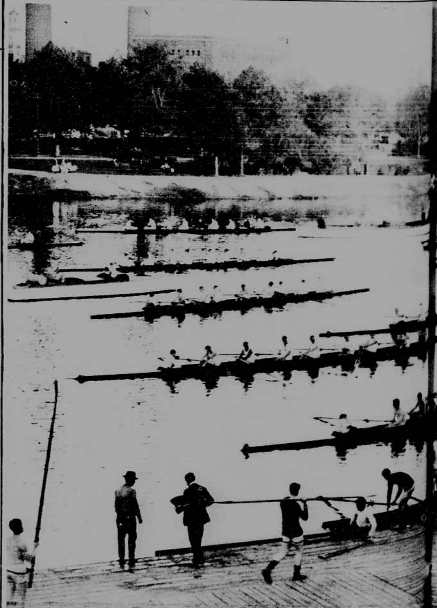
JOHNNY HARVARD OUT FOR FALL CREW PRACTICE chasers are busily engaged in the Stadium keeping vast swarms of would-be members of next year's crews. Advantage of Boston's Indian summer.