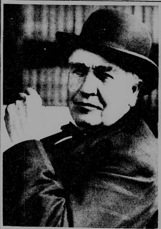
THOMAS A. EDISON , over seventy-two years young, America's foremost inventor snapped the other day in the wizard's laboratory, where he is now at work on a machine of supernatural portent, which, if successful, 'tis rumored will put ouija boards out of business.