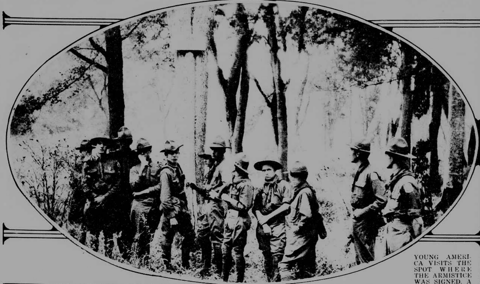
YOUNG AMERICA VISITS THE SPOT WHERE THE ARMISTICE WAS SIGNED. A dozen of the 300 Boy Scouts who recently toured the battlefields of the great war gathered about the tree where Posh signed the armistice. To furnish similar advantages in practical citizenship to as many as possible of the 150,000 unorganized boys of scout age in Greater New York is the purpose of the present campaign.