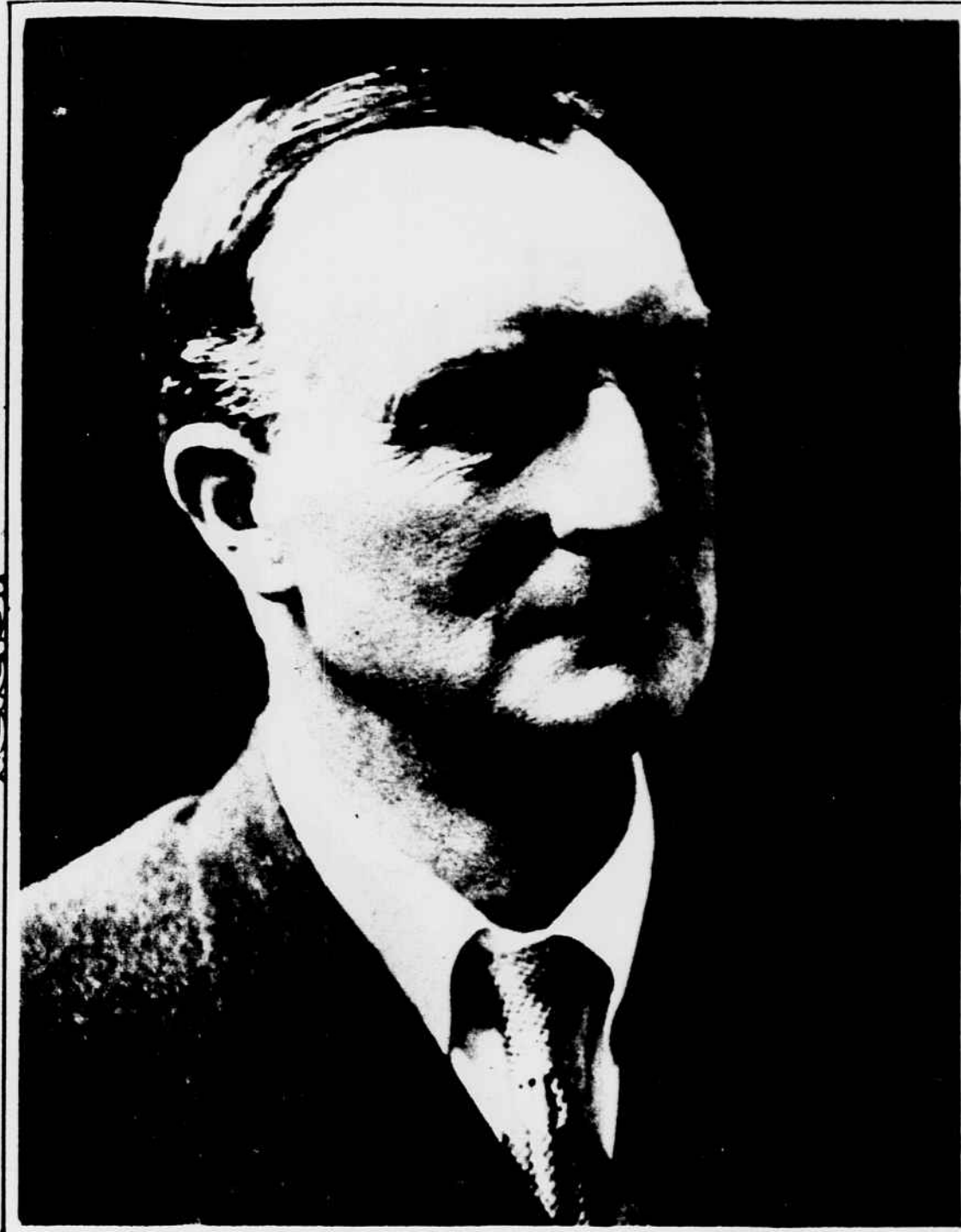
A new photograph of Viscount Grey, who will soon be stationed at Washington as British ambassador.