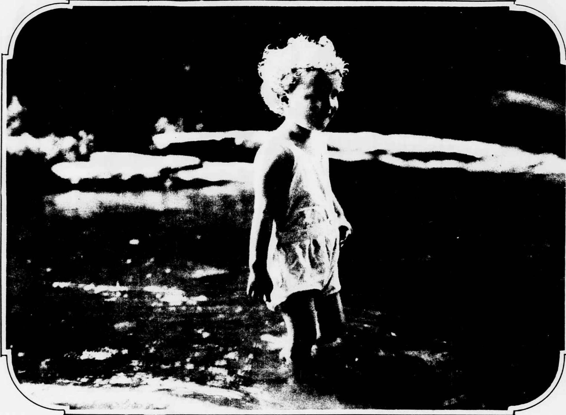
"September Morn in Rock Creek Park."