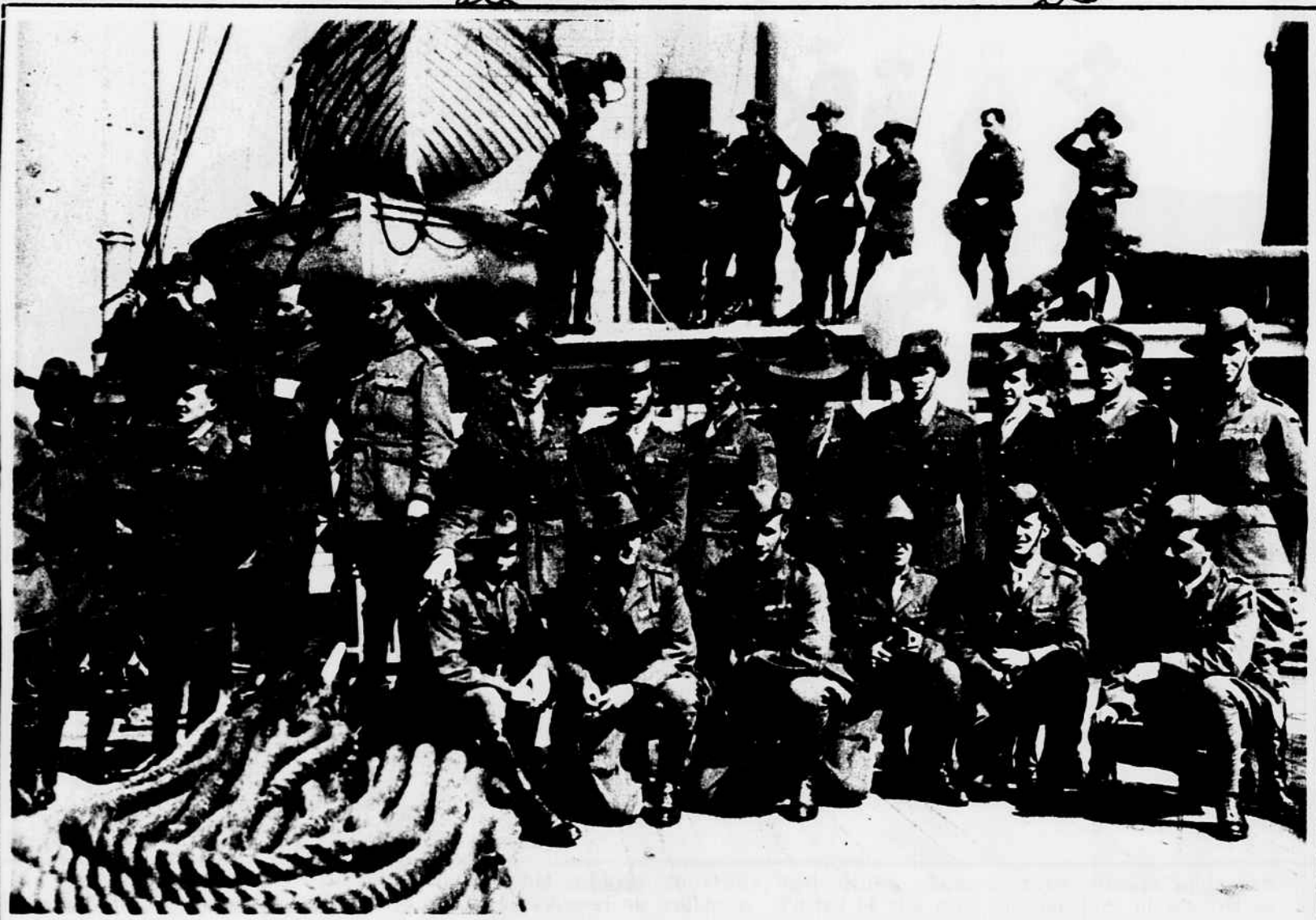
Fighting men from Australia arrive in this country to study agriculture. Ninety-seven officers and men formed the party, which will study at various American colleges. Thirty of the men are wearers of war decorations.