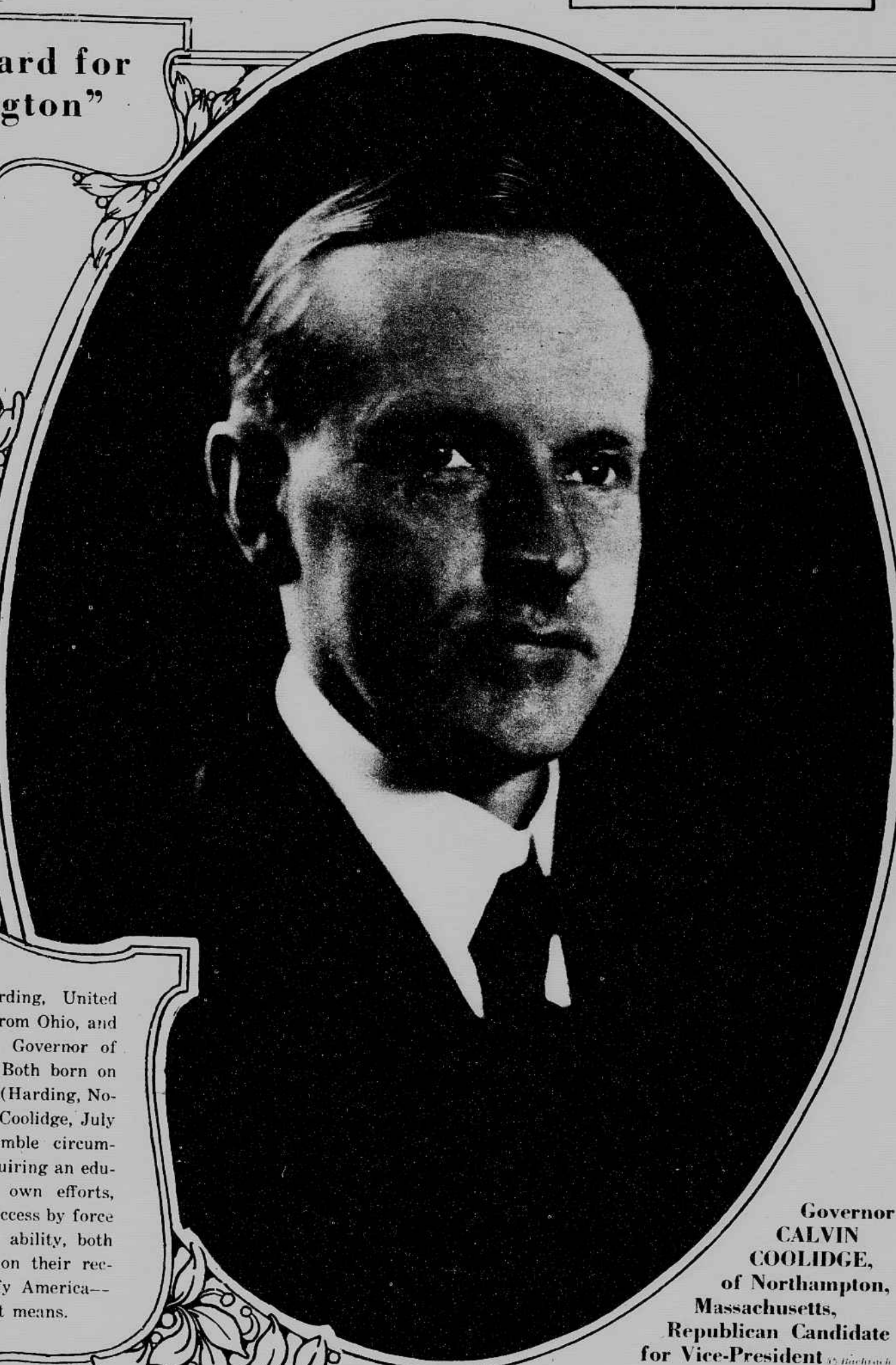
Governor CALVIN COOLIDGE, of Northampton, Massachusetts, Republican Candidate for Vice-President

Warren G. Harding, United States Senator from Ohio, and Calvin Coolidge, Governor of Massachusetts. Both born on significant dates (Harding, November 2, 1865; Coolidge, July 4, 1872) in humble circumstances, both acquiring an education by their own efforts, both achieving success by force of character and ability, both without a stain on their records. They typify America-- what it is, what it means.