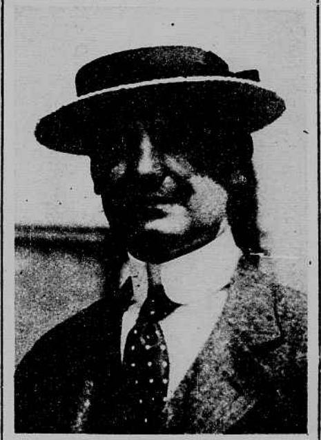
Do you recognize him? Perhaps not, in civilians and straw hat. Colonel William J. Donovan, former commander of the famous "Fighting 69th" of New York (which did such splendid work in France as the 165th U. S. Infantry), arrives in New York after a business trip abroad.