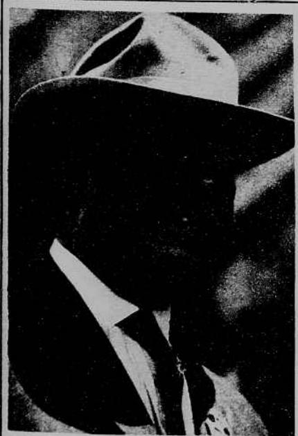
Not a cowboy movie actor, but William Hale Thompson, Mayor of Chicago, who bolted the Republican National Convention as an Illinois delegate because he couldn't stick to his instruction to vote for Governor Lowden for the Presidential nomination.