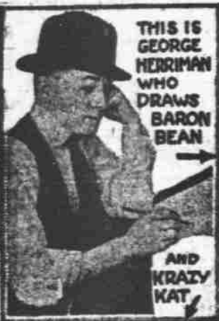
THIS IS GEORGE HERRIMAN WHO DRAWS BARON BEAN AND KRAZY KAT.