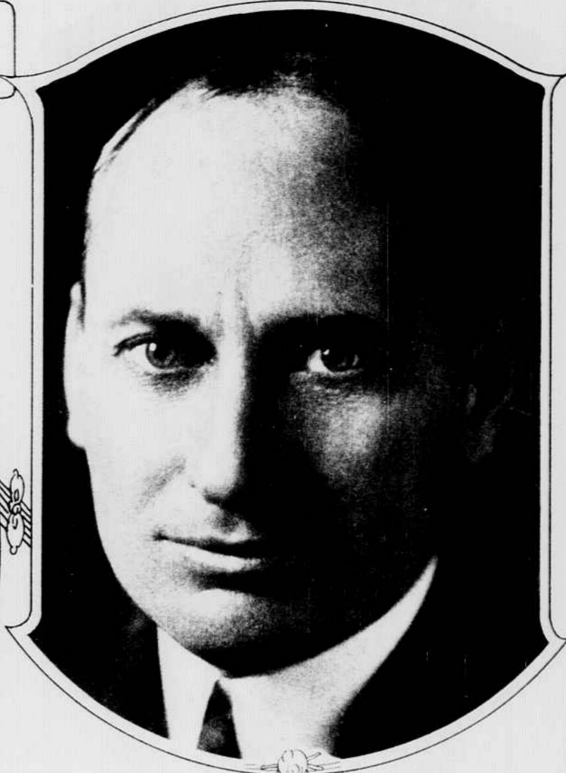
Howard Coffin, chairman aircraft production board, Council of National Defense.