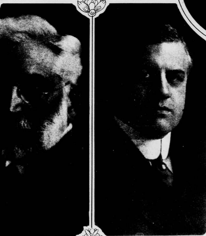
Robert S. Brookings, member of war industries board, Council of National Defense.