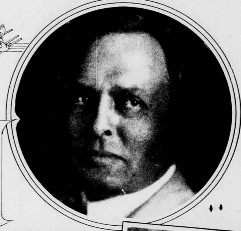
Harry A. Garfield, fuel administrator.