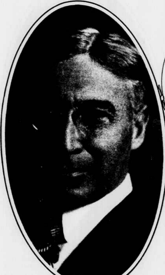
Bernard Baruch, member of war industries board, in charge of raw materials, Council of National Defense.