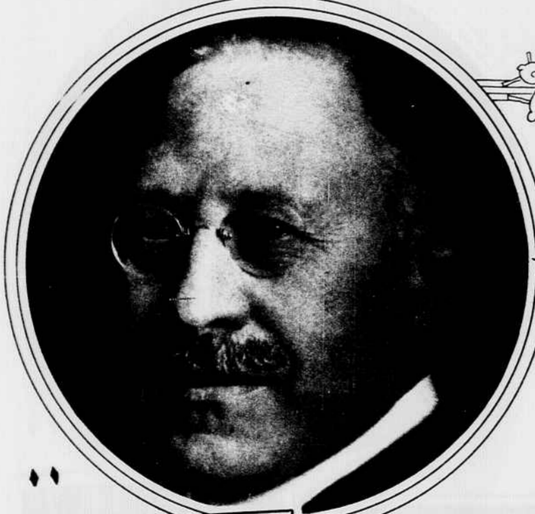
Julius Rosenwald, chairman committee on supplies, Council of National Defense.