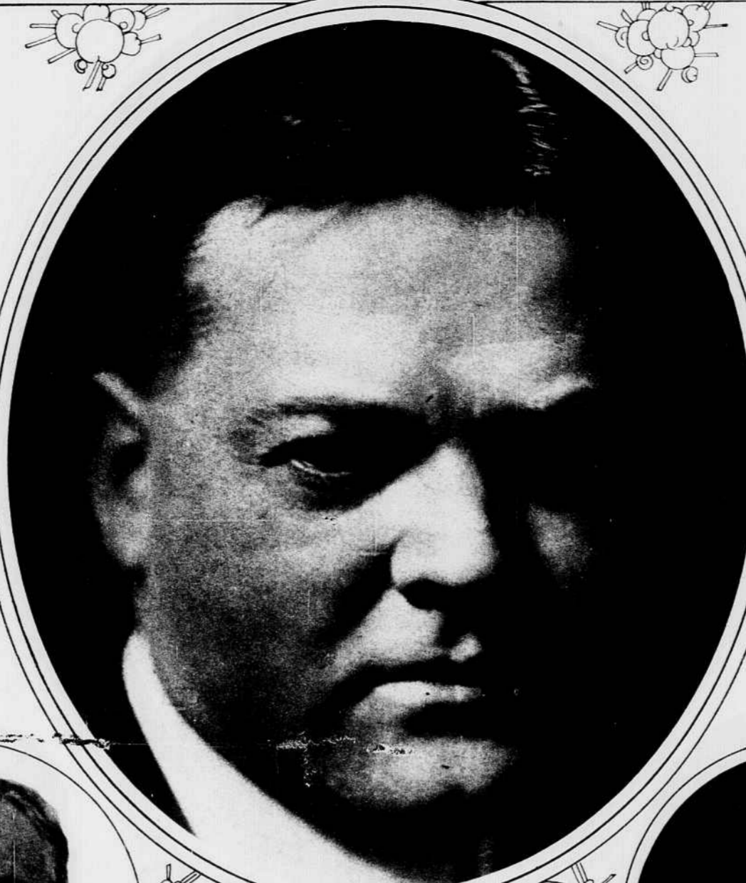
Herbert C. Hoover, food administrator.