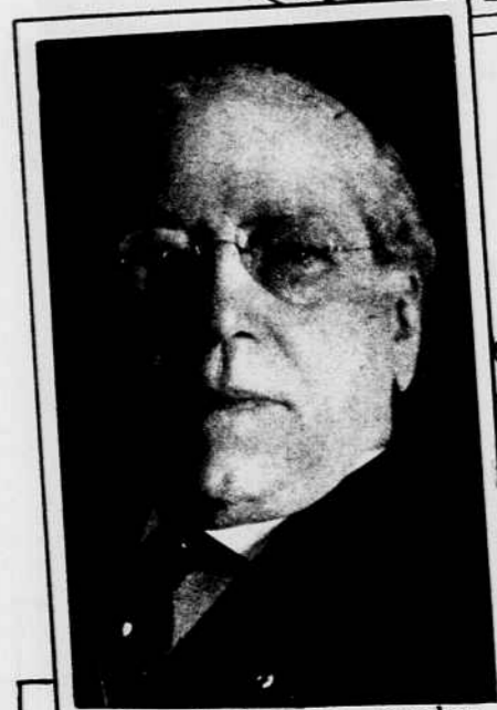
Samuel Gompers, member of advisory commission and chairman of committee on labor of Council of National Defense.