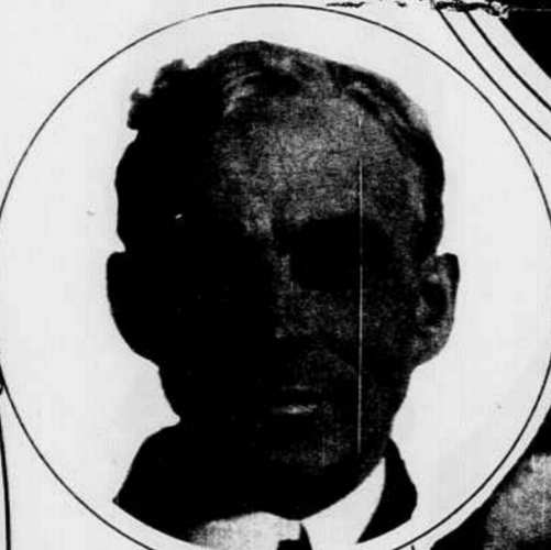
Henry Ford, volunteered services to shipping board in any capacity.