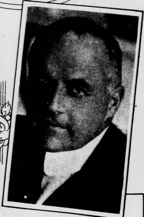
Vance McCormick, chairman of war trade board, member of American mission to allied war council.