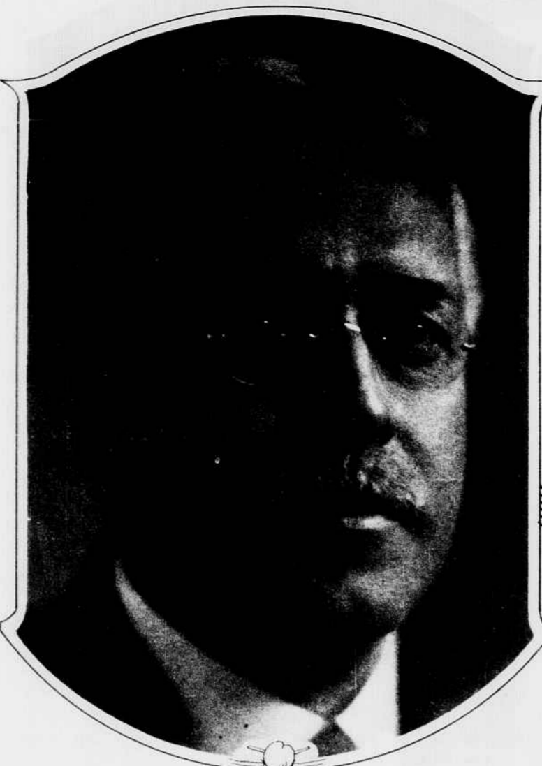
Frank A. Vanderlip, chairman committee on war savings certificates.