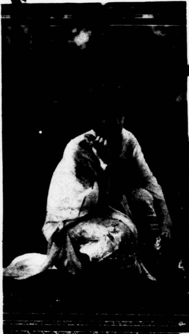
Viola Dana, who will appear in person at Loew's Palace four days, commencing today.