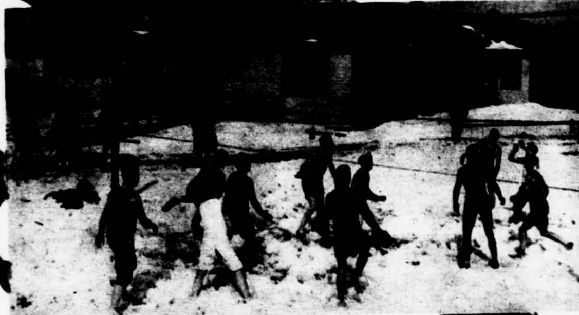
Some more undress uniform stunts at Bolling Field. Officers, this time, "enjoying" volleyball.