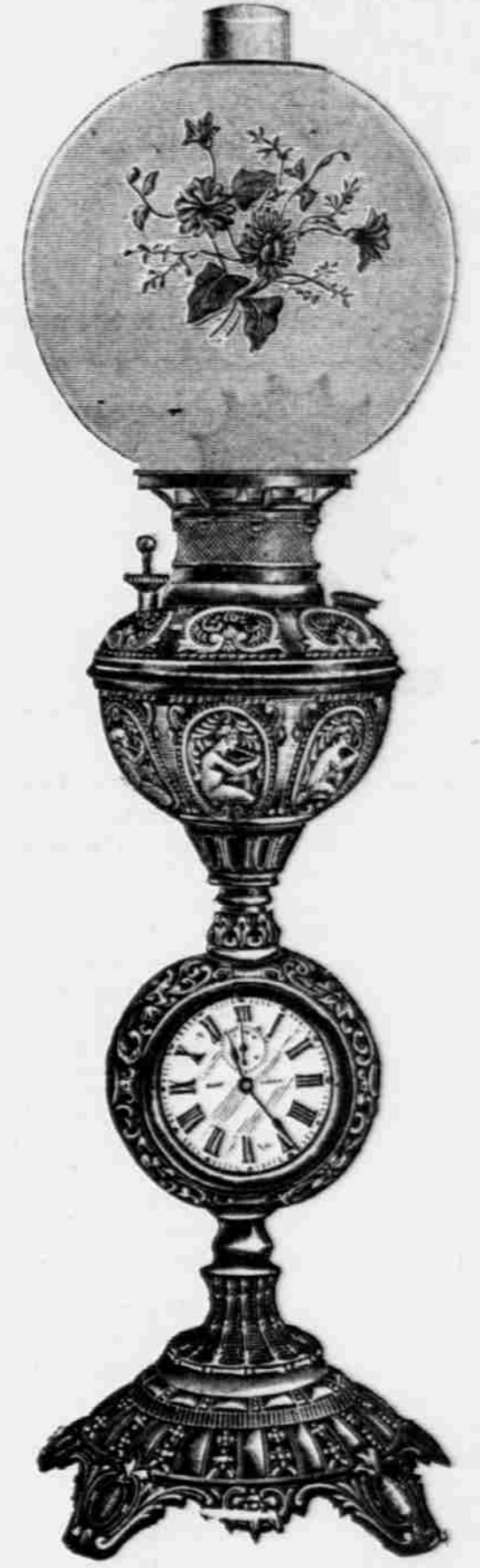
No. 1. THE HANDSOMEST LAMP-CLOCK MADE.

Send 5 cash yearly subscribers for this handsome banquet lamp.