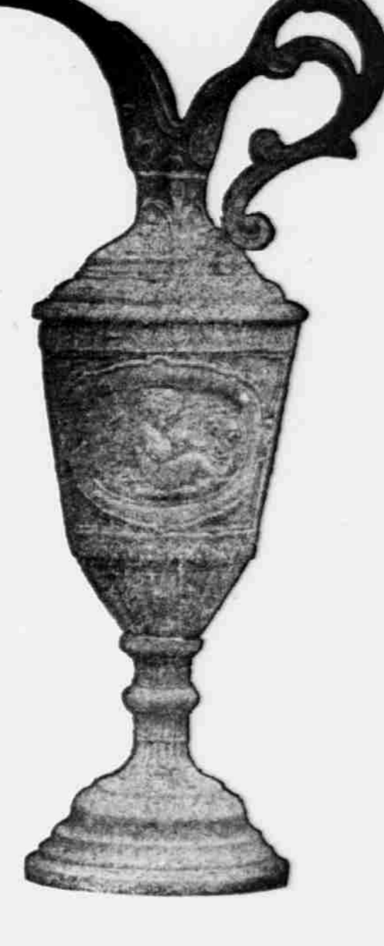
No. 758. GOLD-PLATED VAS

No. 15. REALLY A BEAUTIFUL CHAIN AND A NICE PRESENT. Charm, sardonic intaglio. Right up to date. Trace link. Perfectly formed in every way.