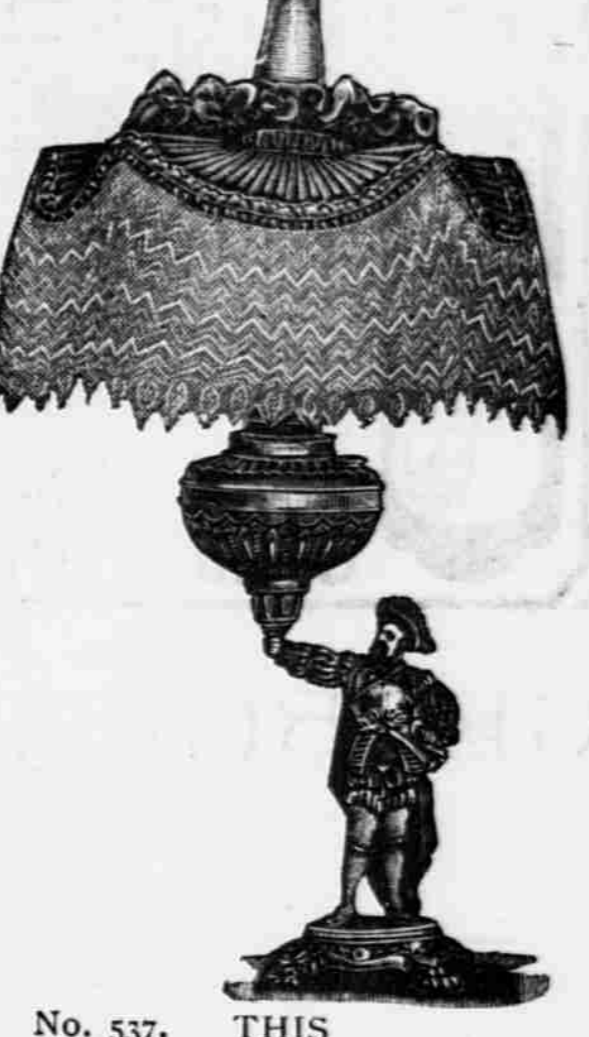
No. 537. THIS HANDSOME LAMP.

A GIFT EVERYBODY, 50,000 Subscribers wanted-A great sacrifice to obtain them.-Look at our offer.