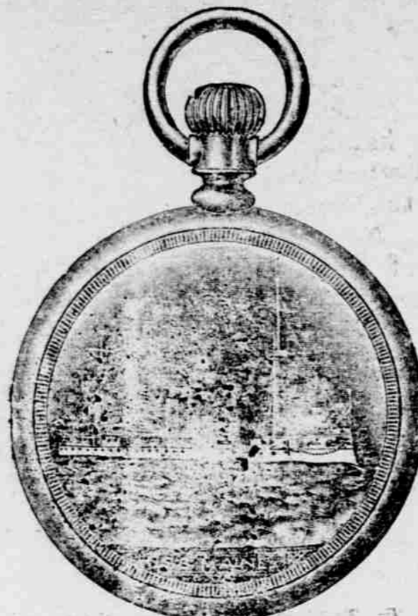
The noble victim of Spanish treachery.

These watches are stem-set and stem-wind Waltham or Elgin works, as preferred. They are open-face, with heavy bevel-glass crystal, in a silverine case, engraved on the back as in the illustrations.