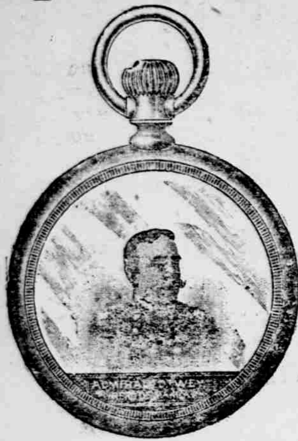
A fine portrait of the hero of Manila.