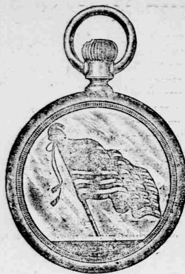
The Star Spangled Banner.