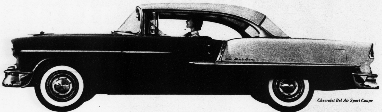
Chevrolet Bel Air Sport Coupe

With a view to giving you— high style and high power in every price class