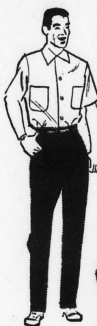
4 Slacks with sport shirts