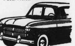
Consul (Sedan & Conv.)