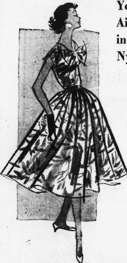
Lansburgh's—BUDGET DRESSES—Second Floor

All the beauty of airy chiffon! The practicality of nylon! Both combined in Supreme's airy sheer nylon chiffon with the filmy-soft skirt, the feminine bow! Delicate blue or rose print on white, sizes 12 to 20 . . . 10.98