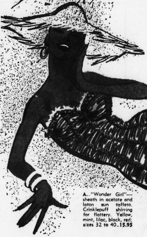
A. "Wonder Girl"—sheath in acetate and rayon sun taffeta. Crinklepuff shirring for flattery. Yellow, mint, lilac, black, red; sizes 32 to 40. 15.95