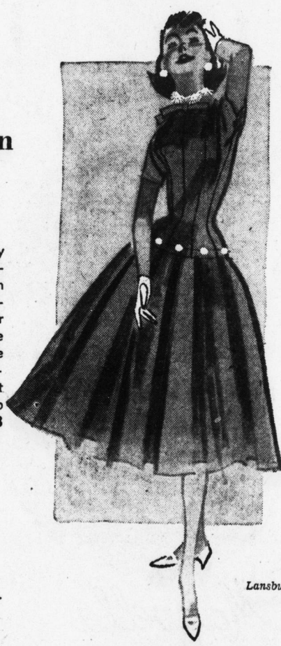
Lansburgh's—JUNIOR DRESSES—Second Floor

Now is the Time to Store Your Furs! Call NA. 8-9800