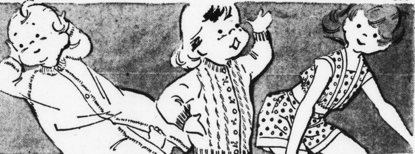
7. Fine quality combed cotton gowns and kimono for infants. White and pastels. Gripper hoods. 88c 8. Infants' sweaters in wools, nylons and orlons. Pretty pastels, dainty detail. Sizes 1 to 3. 1.88 9. Cotton plisse pajamas for girls. Popular mid-riff style. Assorted prints and colors. Sizes 4 to 8. 1.00