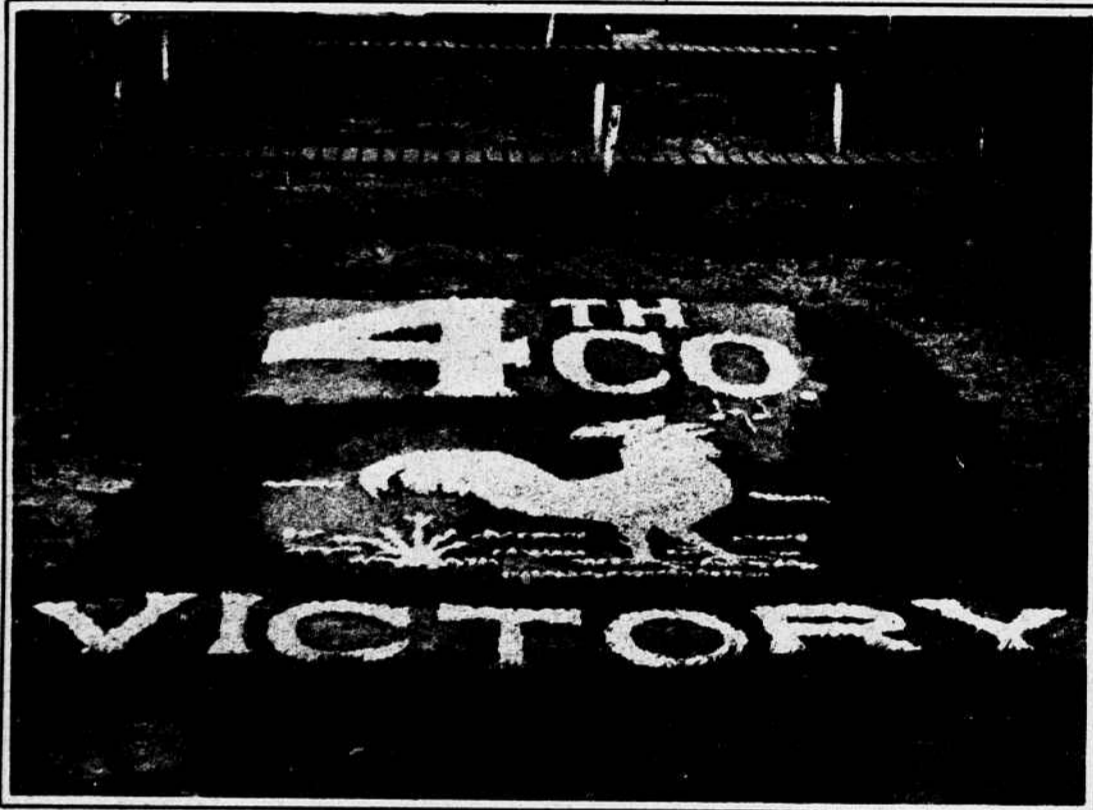
One of the floral designs in a company garden at Camp Meigs.