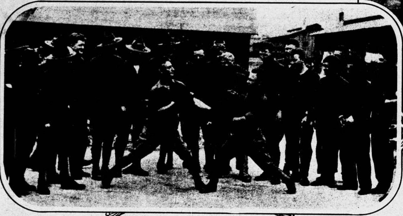
A friendly bout during leisure moments.