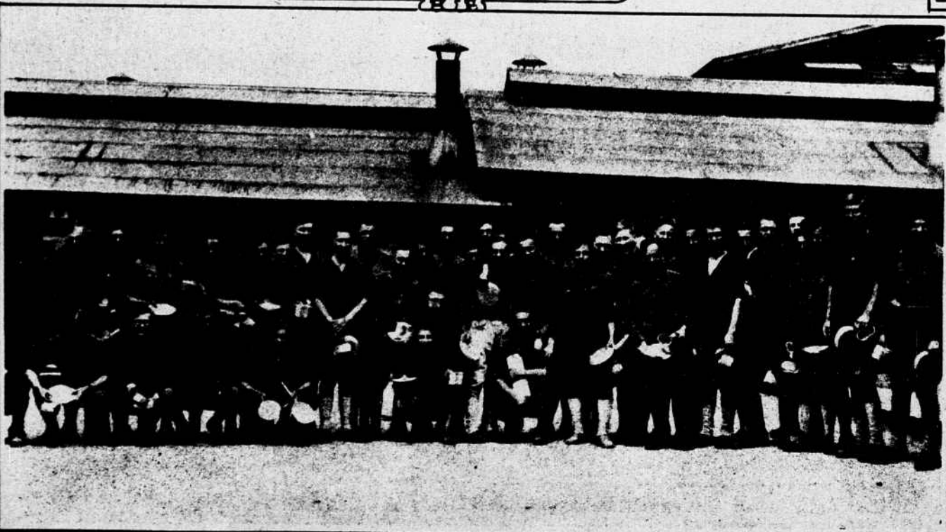
Mess time at the camp is always a time of rare enthusiasm and big appetites.