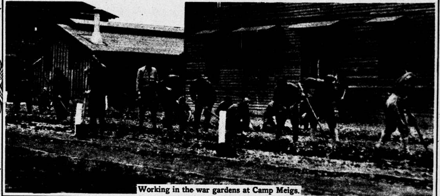
Working in the war gardens at Camp Meigs.