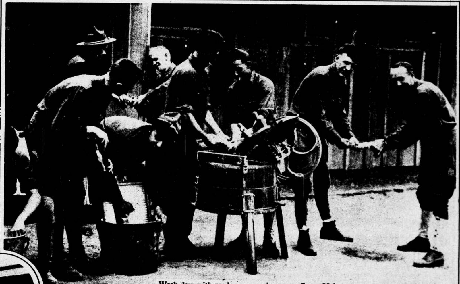
Wash day, with modern conveniences, at Camp Meigs.