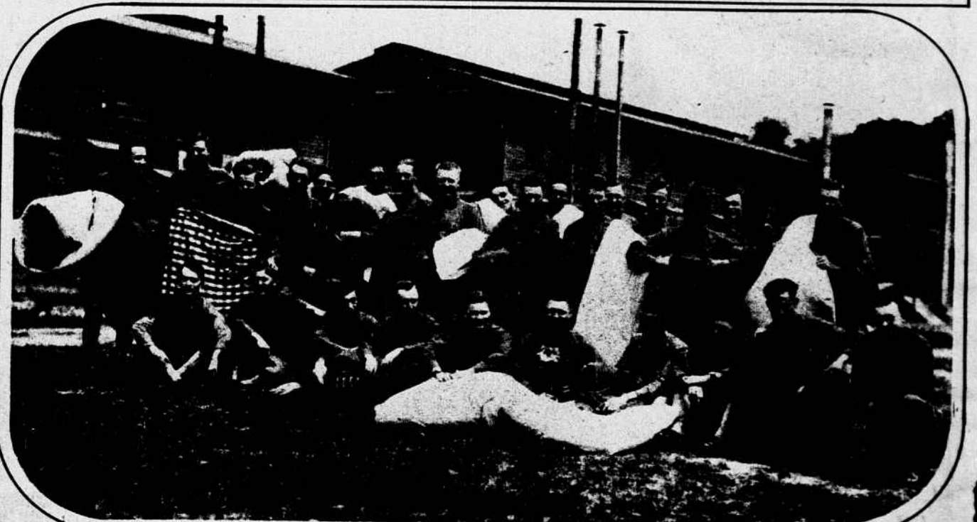
The boys of the Camp Meigs band airing their bedding.