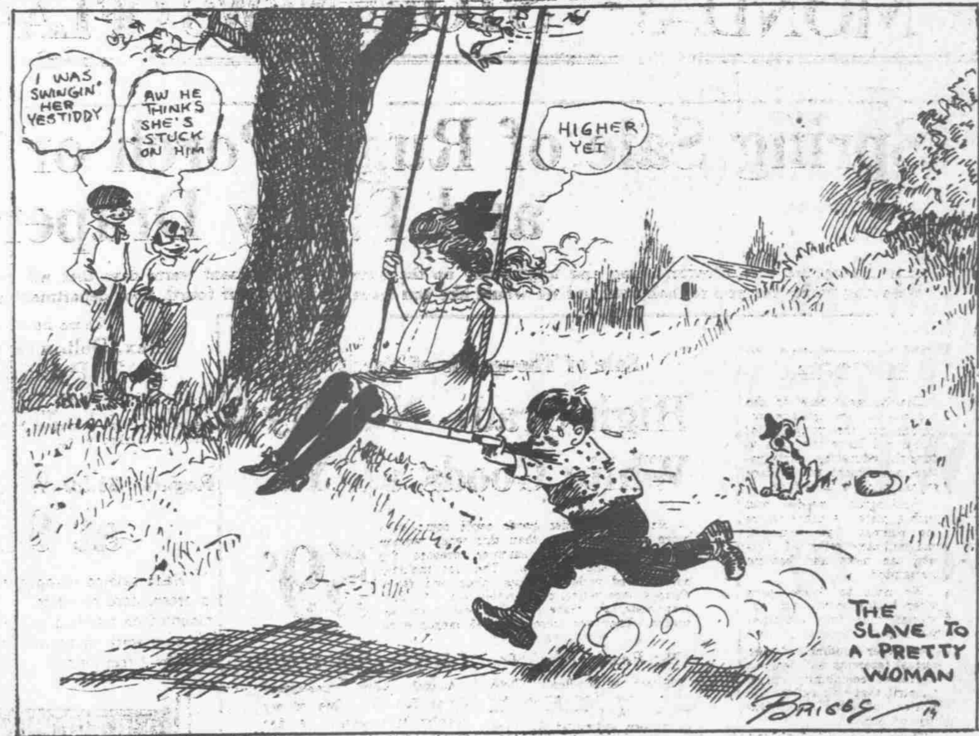
THE SLAVE TO A PRETTY WOMAN