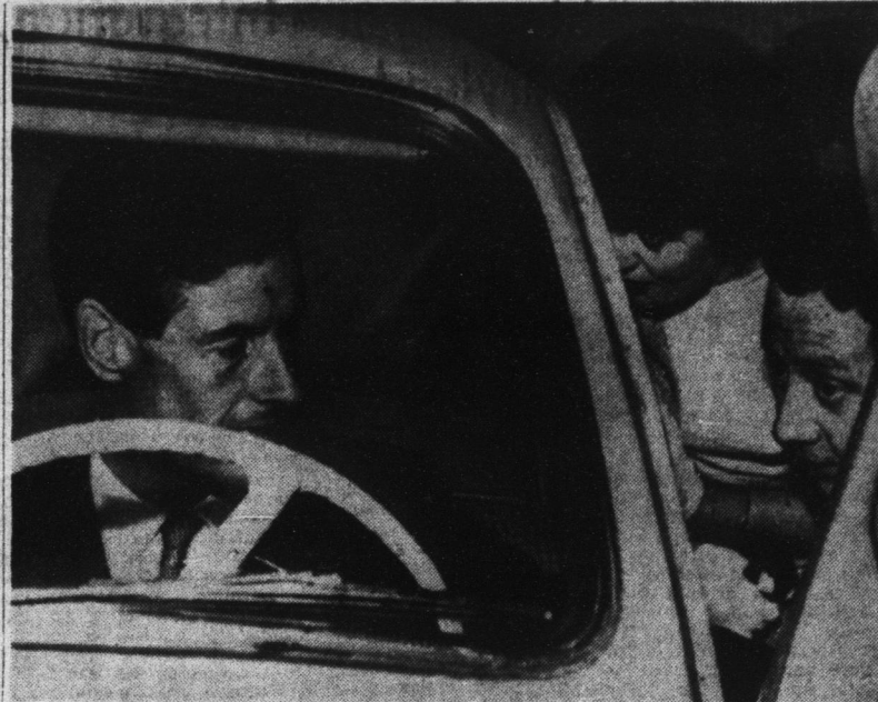
CAPT. TOWNSEND IS BESIEGED—London.—Part of the crowd outside Clarence House closes in on RAF Group Capt. Peter Townsend, eager for news about his reported romance with Princess Margaret.

A Christian mission school in Chinglepet, India, is in trouble with the Madras government, being charged with appealing to foreign countries for financial aid. This, the education minister of Madras told the state assembly, is against the law. The school "had also made some remarks derogatory to the self respect of India," the minister reported.