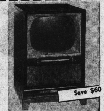
Philco 21" Console TVs

Practically cooks by itself! Roastmaster tells you temperature of roast outside of oven; jiffy griddle; electric timer.