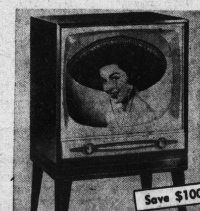
Philco 1955 TV 24" Console

Brilliant TV, powerful radio and 3-speed record player in mahogany veneer cabinet with half doors. Complete family entertainment!