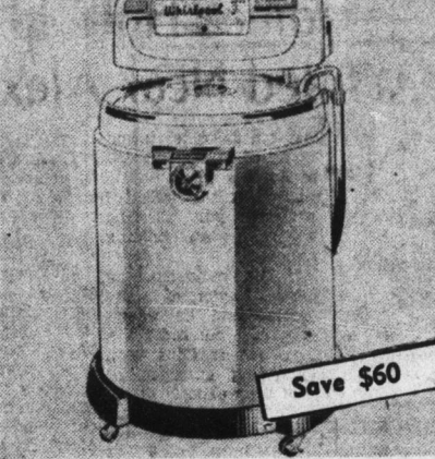
Whirlpool 1956 Wringer Washers

Does a full service for 8 automatically—just roll it out, attach to faucets, plug it in. Store in the closet; no plumbing needed.