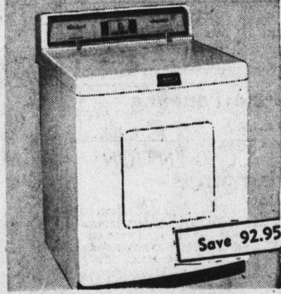
Whirlpool 1955 Electric Dryers

Roll-easy cleaning at its most efficient—follows you around the house. Includes all attachments, disposable dust bags and papoose.