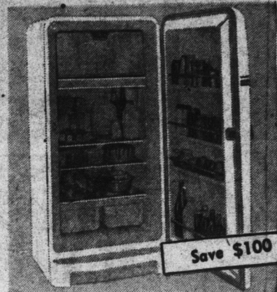
Norge 1955 De Luxe 10-Cu.-Ft. Refrigerators

See TV the natural way, the way you read your newspaper! Full-door mahogany veneer cabinet, 21" picture tube, dual speakers.