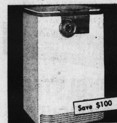
General Electric 1955 Portable Dishwashers

Has peek-through oven door, swing-out broiler, oven heat regulator, top lighting, minute-minder clock.