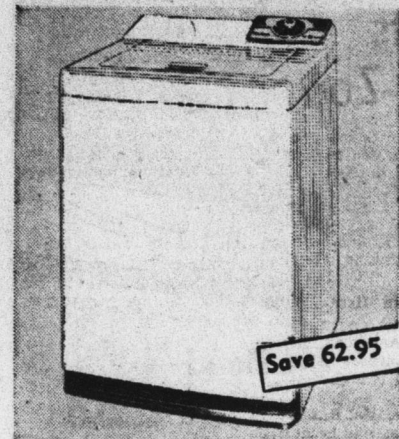
Whirlpool Automatic Washers

Room for a whole week's shopping without crowding! Full-width freezer chest, twin porcelain crispers, tall bottle space.