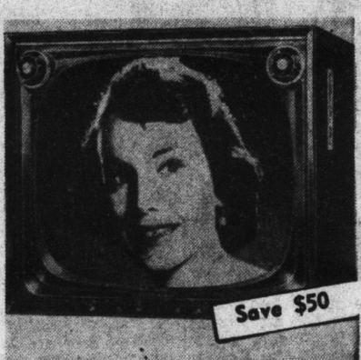
Admiral TV 21" Table Model

Complete your work-free home laundry with this easy-ironing ironer. Two thermostats, knee and fingertip controls.