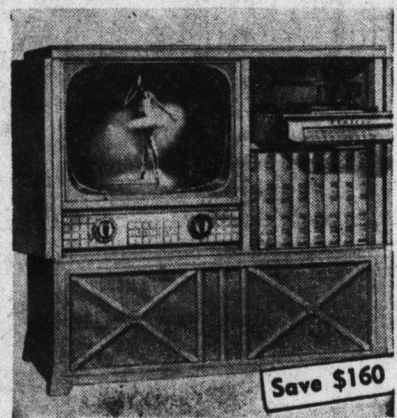
Admiral 21" TV, Radio-Phono Combination

Appliances—5th Floor, Washington; 4th Floor, Silver Spring and PARKington