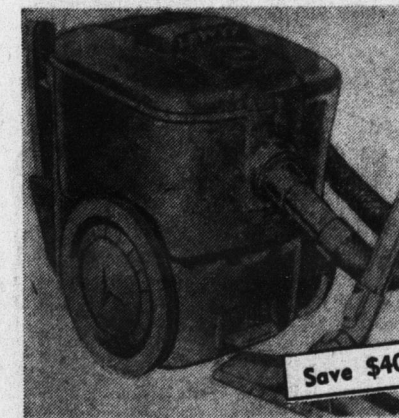
Lewyt 1955 Big Wheel Canister Vacuums

Powerful Philco chassis brings in clear reception even in fringe areas. Aluminized picture tube, fingertip tuning, mahogany color wood cabinet.