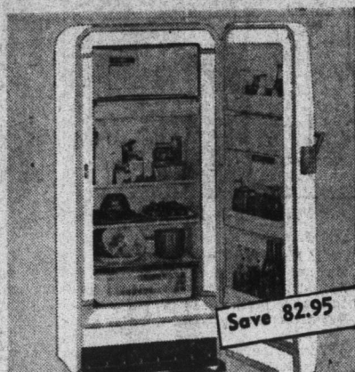
Frigidaire 1955 9-Cu.-Ft. Refrigerators

Dual speakers in mahogany veneer cabinet with 3-speed changer and 10 records from pre-selected group. In blond finish. 89.95