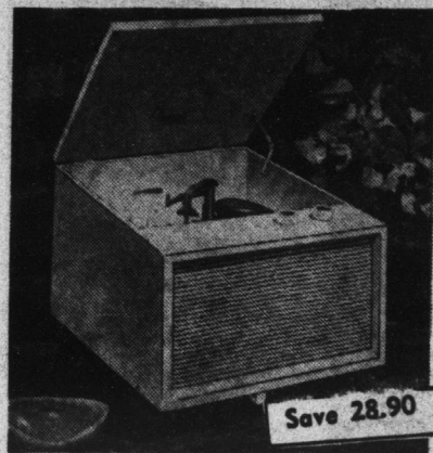
Webcor Hi-Fi Phono and 10 LP Records