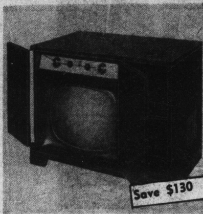
GE 1956 Full-Door Lo-Boy 21" Console TV

Aluminized picture tube in mahogany finish cabinet. Just 12. $133