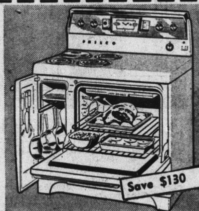
Philco 1955 De Luxe Electric Ranges

5th Floor, Washington; 4th Floor, Silver Spring; Street Floor, PARKington