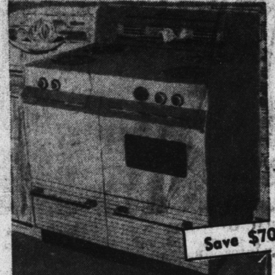
Magic Chef 1955 Gas Ranges

Mahogany wood cabinet with 21-inch aluminized picture tube and super cascade chassis. Convenient, no-stoop top tuning.