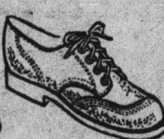
Stitched U-tip like Dad's, BROWN crushed leather.