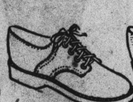
Two-tone BROWN saddle with cushion crepe sole.