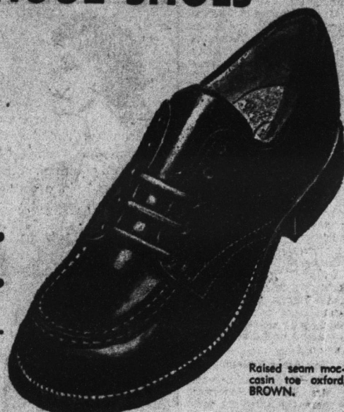
Raised seam mocasin toe oxford, BROWN.

Thrifty shopping for boys' and girls' shoes is easy-as-ABC! A group of our best-selling GRO-NUPS are reduced 20% . . . each made to Hahn's high standards with sturdy lasts and Goodyear welts. Sizes 8½ to 3.