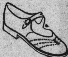
Double-strap sandal with stitching, BROWN or RED.