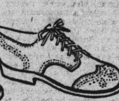
Scuffproof tip, five-eyelet oxford in BROWN.

Children's Shoes at all stores except 14th & G