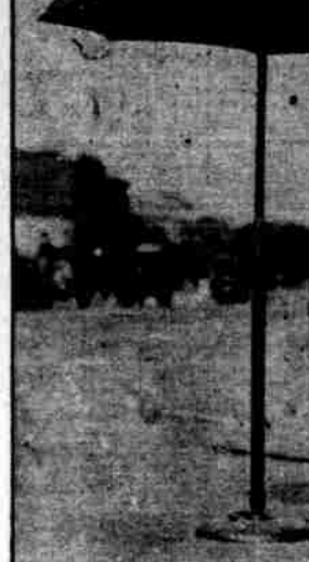
Proof of the Geographical Center.

From the Kansas City Times. A point ten miles north of Smith Center is found to be the exact geographical center of the United States. Those who have reached this point are able to prove it by their Eskimo and by records buried at Etah and they are willing to appear before the University of Copenhagen at any time.