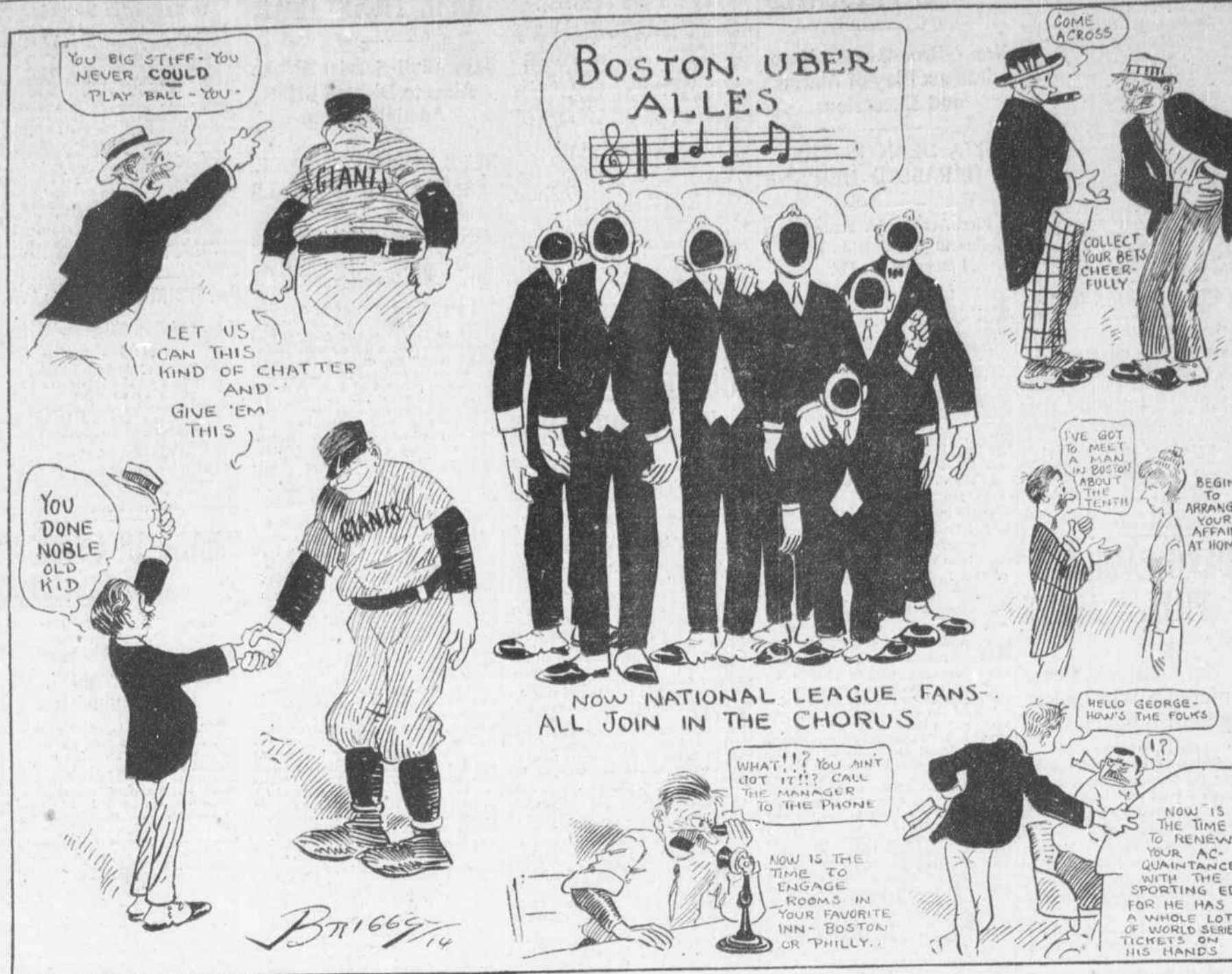
YOU BIG STIFF YOU NEVER COULD PLAY BALL--YOU LET US CAN THIS KIND OF CHATTER AND-- GIVE 'EM THIS YOU DONE NOBLE OLD KID