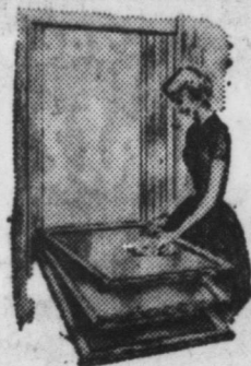
SCREEN AND GLASS PANELS TILT INSIDE FOR EASY CLEANING

YOUR SELECTION BACKED BY THE SAME INTEGRITY AND DEPENDABILITY THAT HAVE MADE THE 10 HOME, INC. STORES FAMOUS IN 4 CITIES. GUARANTEED IN WRITING!