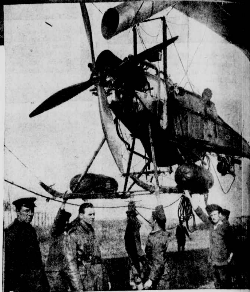
Here is a "close-up" of the car of the British dirigible pictured above. To the layman it looks not unlike the body of an aeroplane.