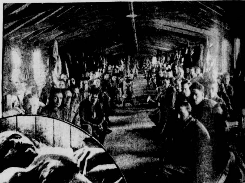
These serious-looking young men photographed inside their building at Madison Barracks, New York, will soon be leading troops "over the top" in the shell-cracked deserts of Northern France.