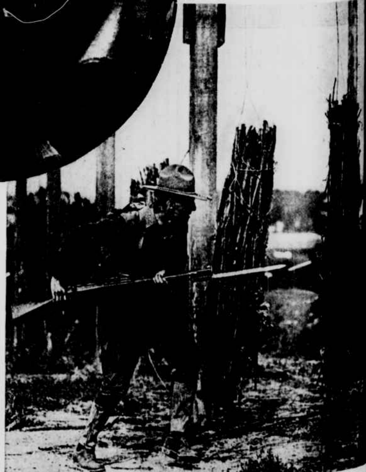
The students at the Officers' Training Camp at Fort Myer spend a good bit of time practising bayonet work on these wood dummies. The Boche stands up against bullets bravely, he dreads the cold steel.