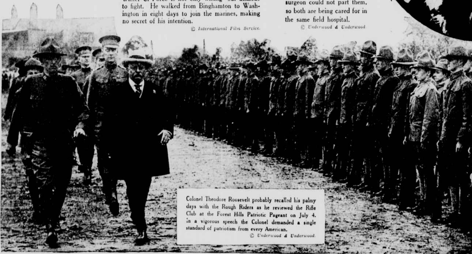
Colonel Theodore Roosevelt probably recalled his palmy days with the Rough Riders as he reviewed the Rifle Club at the Forest Hills Patriotic Pageant on July 4. In a vigorous speech the Colonel demanded a single standard of patriotism from every American.