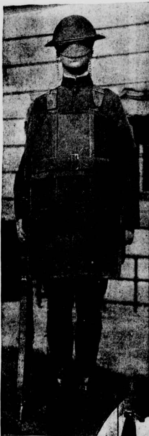
Our boys in the trenches will resemble giant armadillos if the War Department adopts this new type of armor with which it is now experimenting. The body armor is made of a series of thin steel plates, made semi-flexible by being sewn together in a canvas sack.