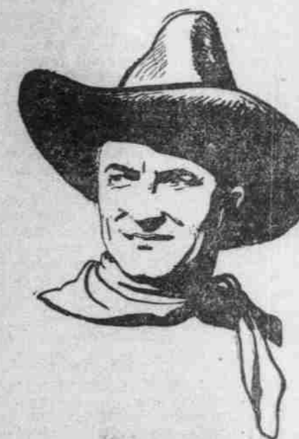
William Farnum, Pastime Sunday.