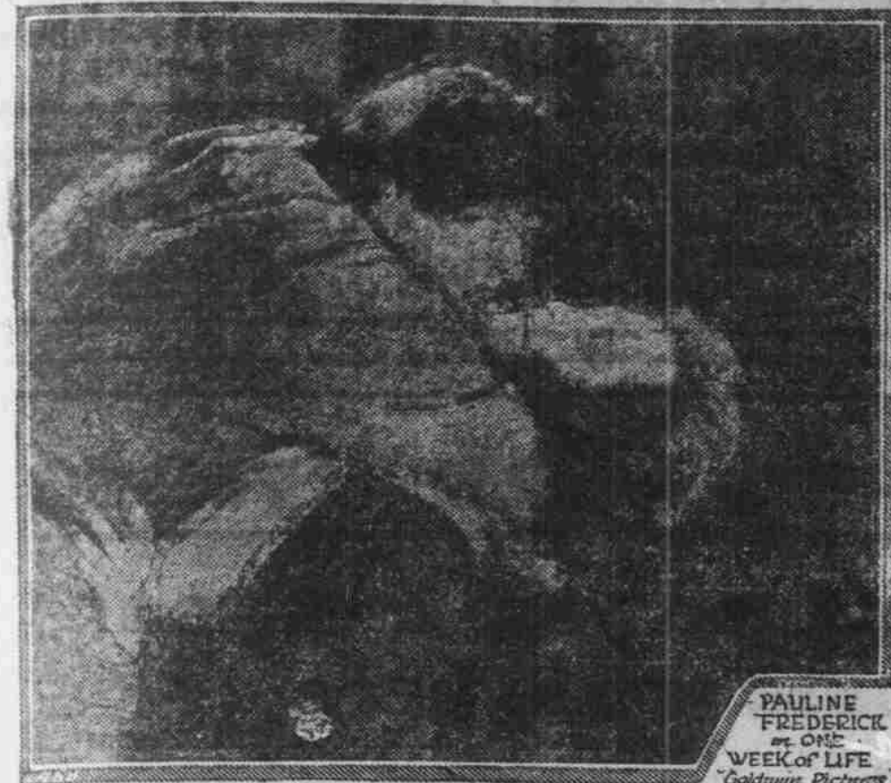
PAULINE FREDERICK in "ONE WEEK OF LIFE" Goldwyn Pictures

COMING TO ISIS TOMORROW FOR ONE DAY ONLY