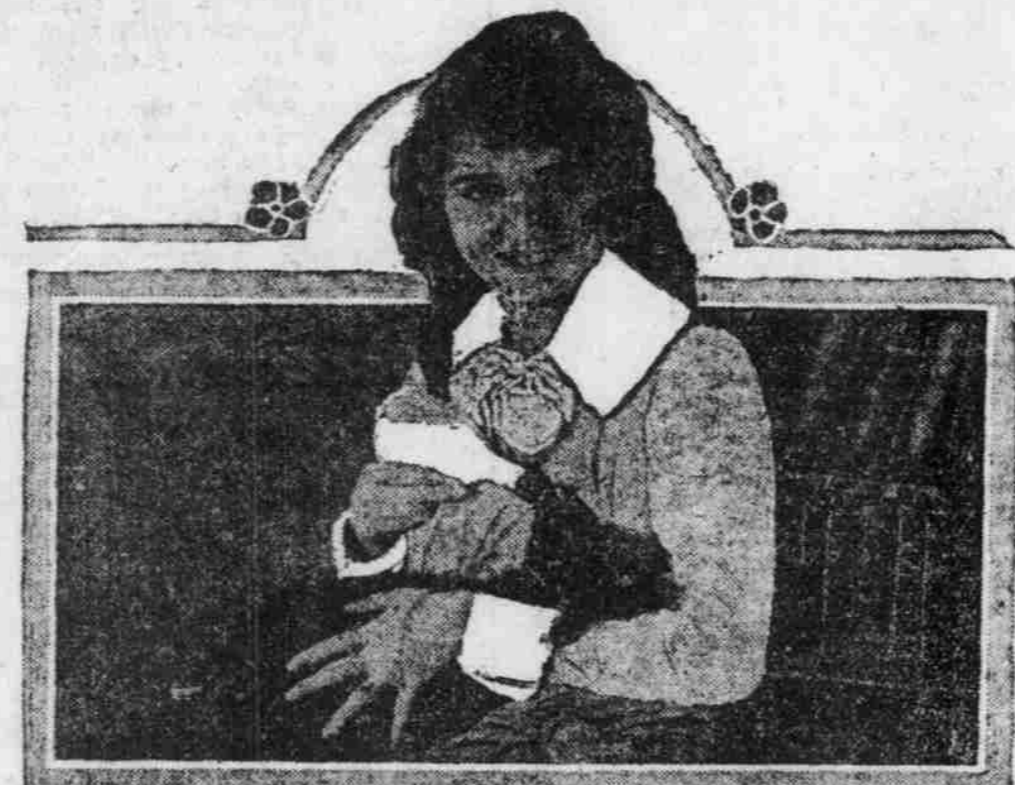
MARY PICKFORD in "Capt. Kidd, Jr."