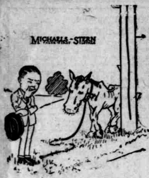
A horse on you!

You can buy a horse for $25 and another for $250.