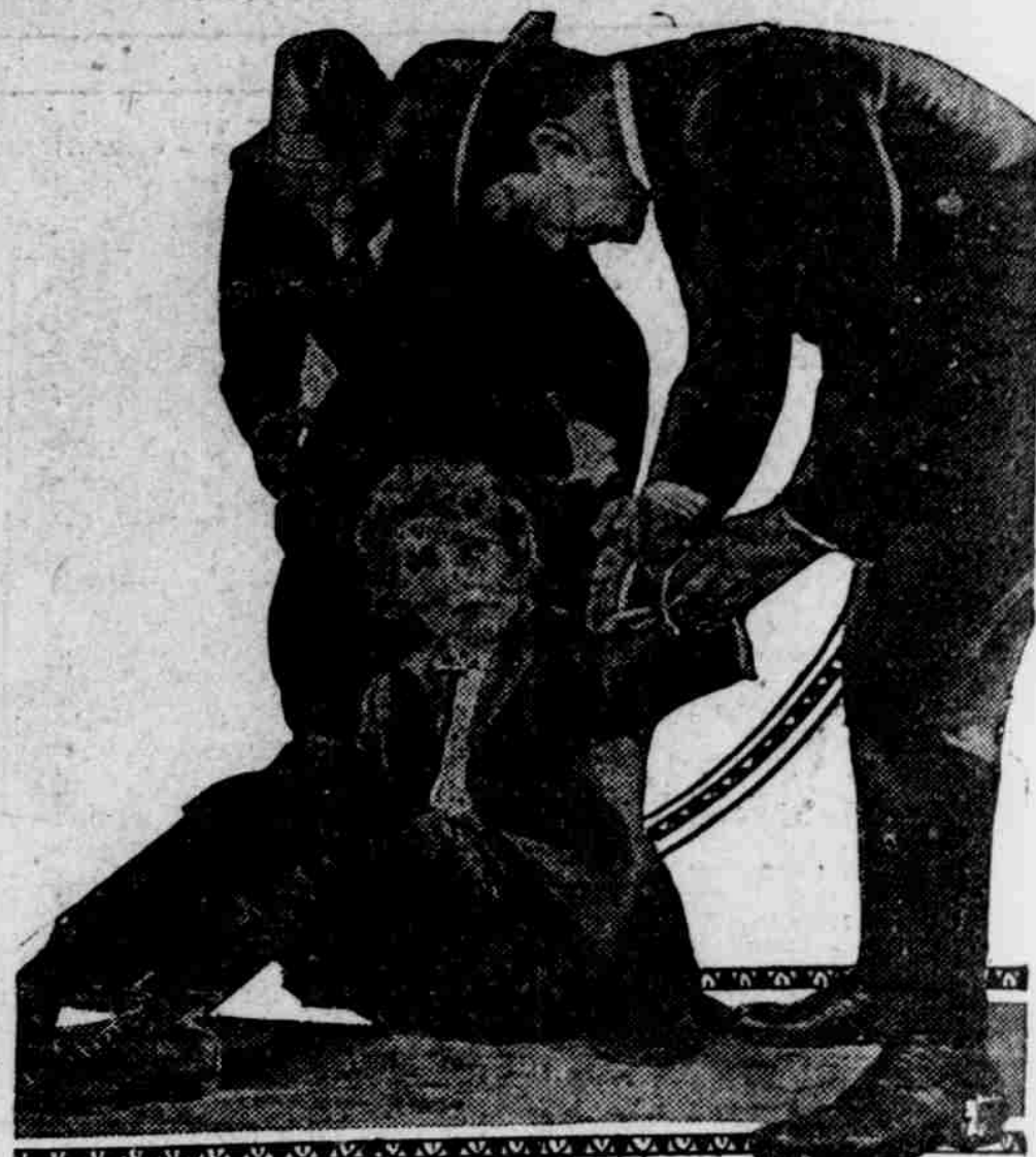
MARY PICKFORD IN THE HOODLUM. Coming to Isis Tomorrow.

Two Hard Boiled Eggs Cause Fracas Another Sennett riot of fun is at the Isis Theatre today. The latest comedy is called "The Dentist." Char- lie Murray is the genial doctor, with a mortgage on Charlie's place, gets angry and threatens to foreclose. Charlie's crook brothers get busy and try to steal the necklace. Everybody thereupon gets into a jam, and a wild fracas results. The climax is said to be one of the funniest things ever shown on the screen. Jim Finlayson is the man who gets sore at Charlie, and Marie Prevost, one of the Sennett beauties, is the typist. Charlotte Mi-