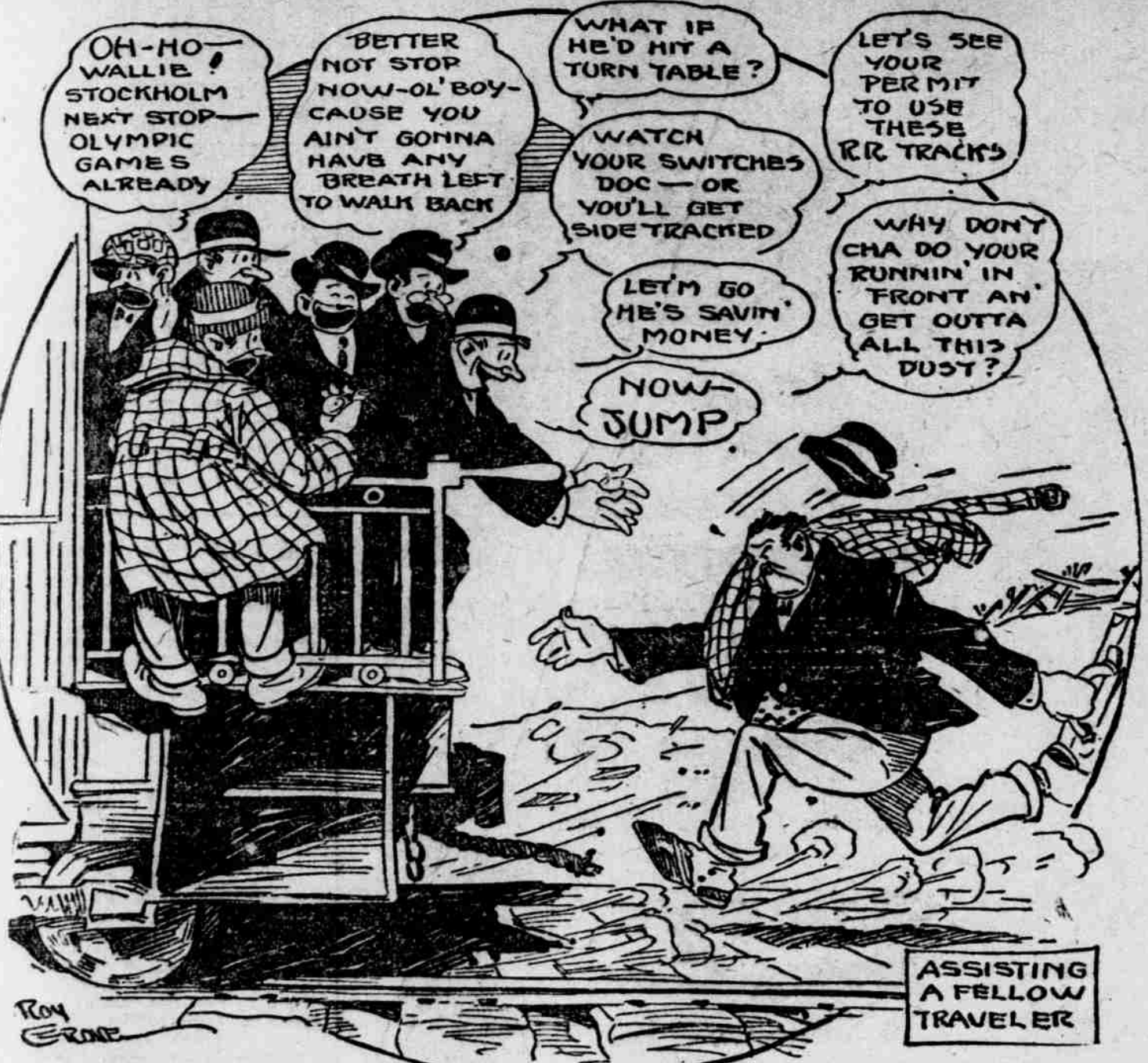
ASSISTING A FELLOW TRAVELER