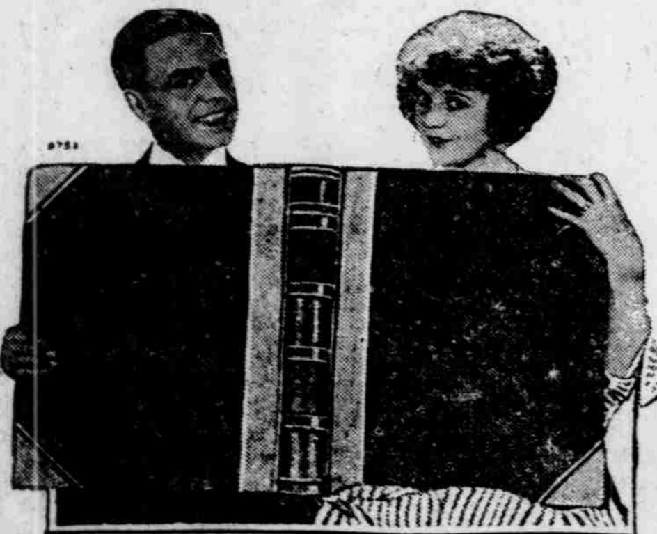
DOUGLAS MACLEAN and DORIS MAY in a scene from the THOS. H. INCE Production 'WHAT'S YOUR HUSBAND DOING?' A PARAMOUNT ARTCRAFT PICTURE

Rub-My-Tism is a great pain killer. It relieves pain and soreness caused by Rheumatism, Neuralgia, Sprains.