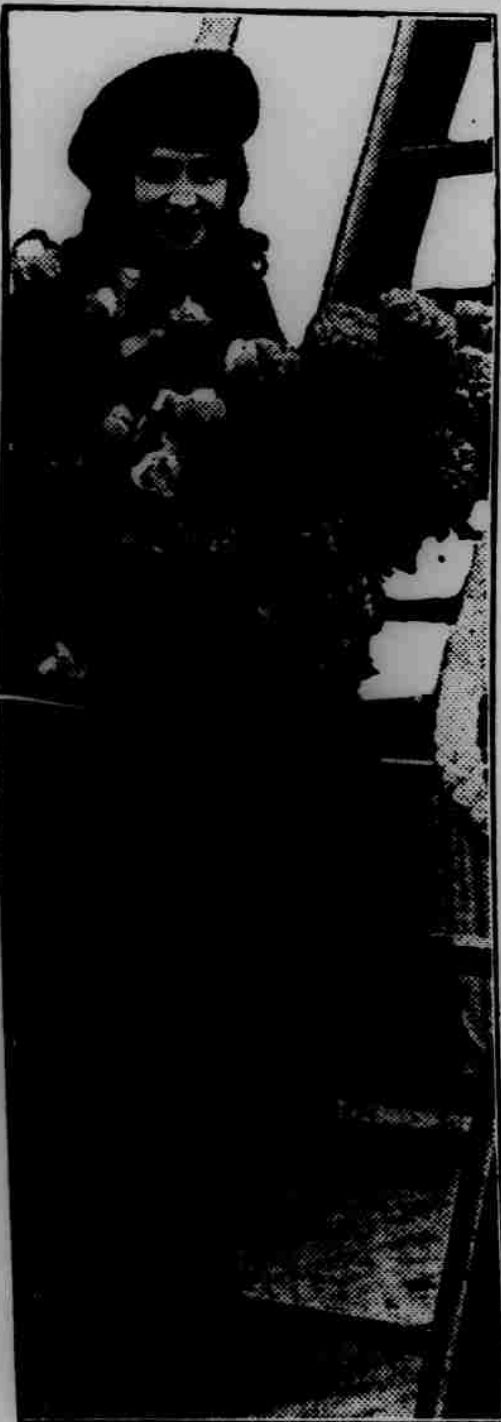
Miss Katherine Stinson, America's greatest female loop-the-loop flyer, sailed recently for Japan and China, where she is under contract to make 20 flights for $50,000. Miss Stinson will fly a Crastor biplane, of the latest model. On her return, Miss Stinson

will, on April, attempt a transcontinental flight from the Pacific coast to the Atlantic. She says it will be based on a four-day basis, and that she is positive she can make the flight in that time. The photo shows Miss Stinson as she boarded a steamer in San Francisco. The bouquet she carries was presented by some of the enthusiastic friends who saw her off to fly in a country where flights have seldom been seen, and are considered heroic exploits. Miss Stinson will be the first woman to fly in China and it is expected that she will crown her efforts with much success. She is not only the youngest aviator but the smallest flyer in the world.