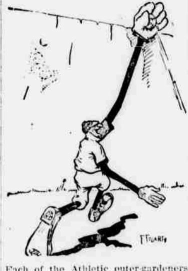
Each of the Athletic out-gardners Contributed a Circus Catch.