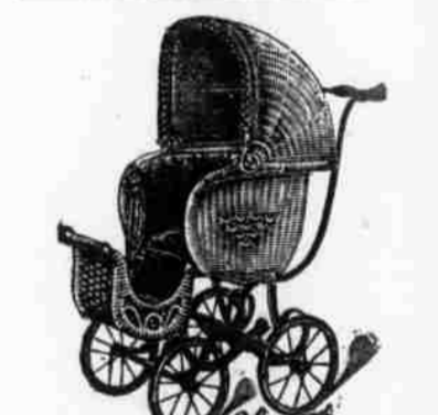
Reed and Rattan Carriages Go-Carts and Sulkies $8.00 Up

Yelverton Furniture Co COMPLETE HOME FURNISHERS Palatka, Florida