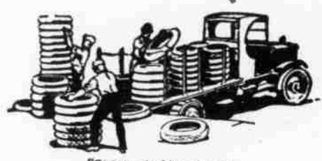
"Giving to the fabric tire user fresh, live tires. Being made now. Being shipped now."

From the makers of U.S. Royal Cords to the users of Fabric Tires