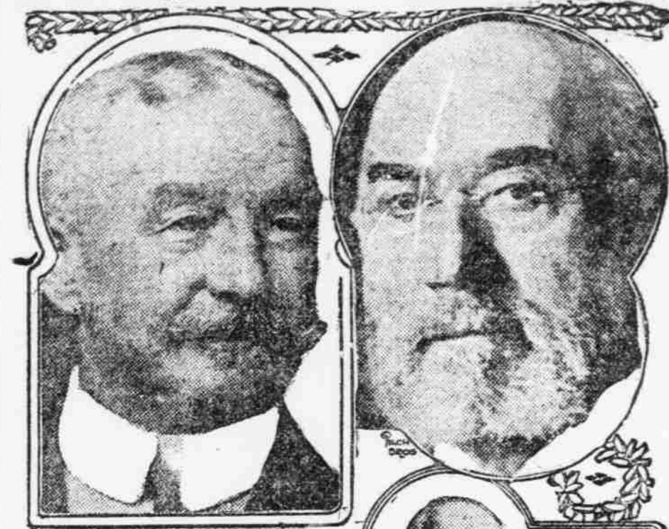
At left, Francis David Miller; upper right, Isador Strauss; lower right, William Stead.