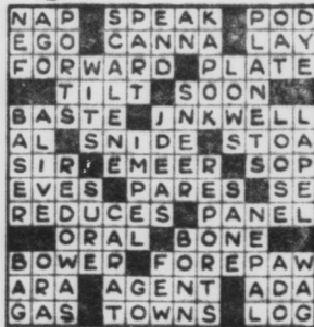
Solution of Yesterday's Puzzle