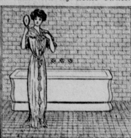
"Standard" "CLARION" BATH