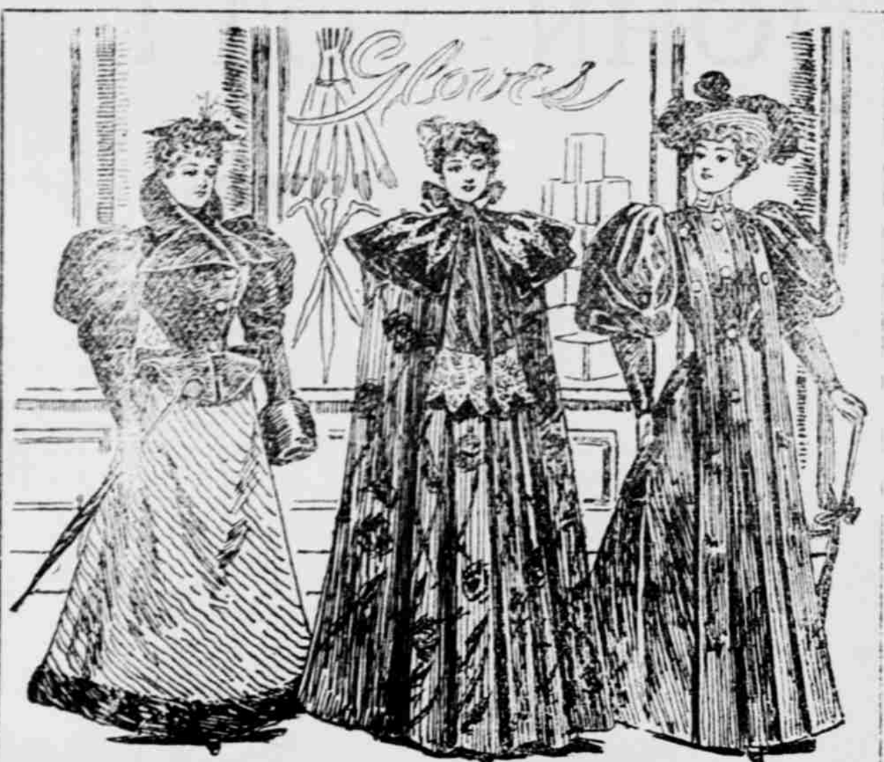
OPERA CLOAK, ULSTER AND DIRECTOIRE JACKET. In the center is an opera cloak of brown satin brocaded with large poppies with green leaves. The upper cape is of brown velvet with unbleached guipure and jet passementerie. At the right is an ulster with large bone buttons and gilet sleeves. At the left is a directoire jacket of black Persian with three large bone buttons.