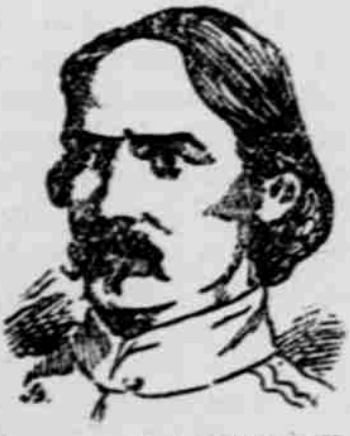
ROBERT L. STEVENSON.

Mr. Stevenson has passed through Honolulu on several occasions, and it was only a little over a year ago that ill-health compelled him to leave his Samoan home and make a visit of several weeks to Honolulu in order to