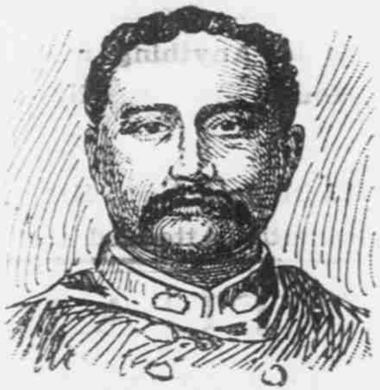
SAM NOWLEIN—Freedom, for turning State's evidence. R. W. WILCOX, Rebel leader—35 years, $10,000 fine.